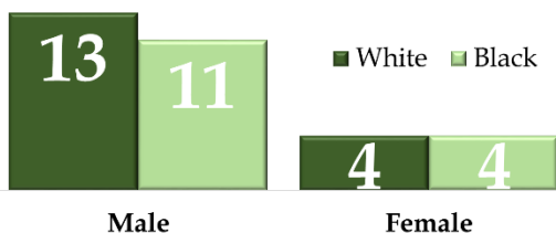
Invasive Liver & Bile Duct Cancer Age-Adjusted INCIDENCE Rates* by Sex and Race Mississippi, 2011-2015

*Rates age-adjusted to the 2000 US Standard Population, per 100,000. Source: 2018 MS Cancer Registry https://www.cancer-rates.info/ms/ ; 2018 CDC USCS Data Visualization https://gis.cdc.gov/Cancer/USCS/DataViz.html