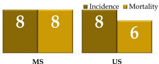
Invasive Liver & Bile Duct Cancer Age-Adjusted INCIDENCE and MORTALITY Rates* Mississippi vs. United States, 2011-2015

*Rates age-adjusted to the 2000 US Standard Population, per 100,000. Source: 2018 CDC USCS Data Visualization https://gis.cdc.gov/Cancer/USCS/DataViz.html