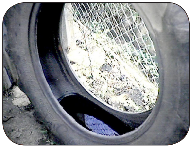
Recycle used tires or keep them protected from rain.