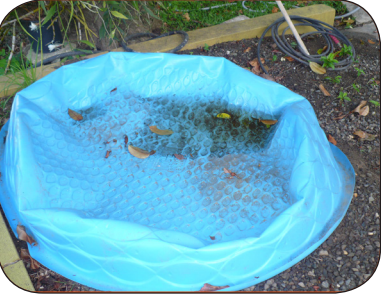
Drain water from pools when not in use.