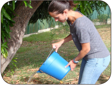
Drain & dump any standing water.