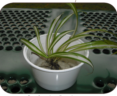
Put plants in soil, not in water

National Center for Emerging and Zoonotic Infectious Diseases Division of Vector-Borne Diseases