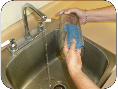
Weekly, scrub vases & containers to remove mosquito eggs.