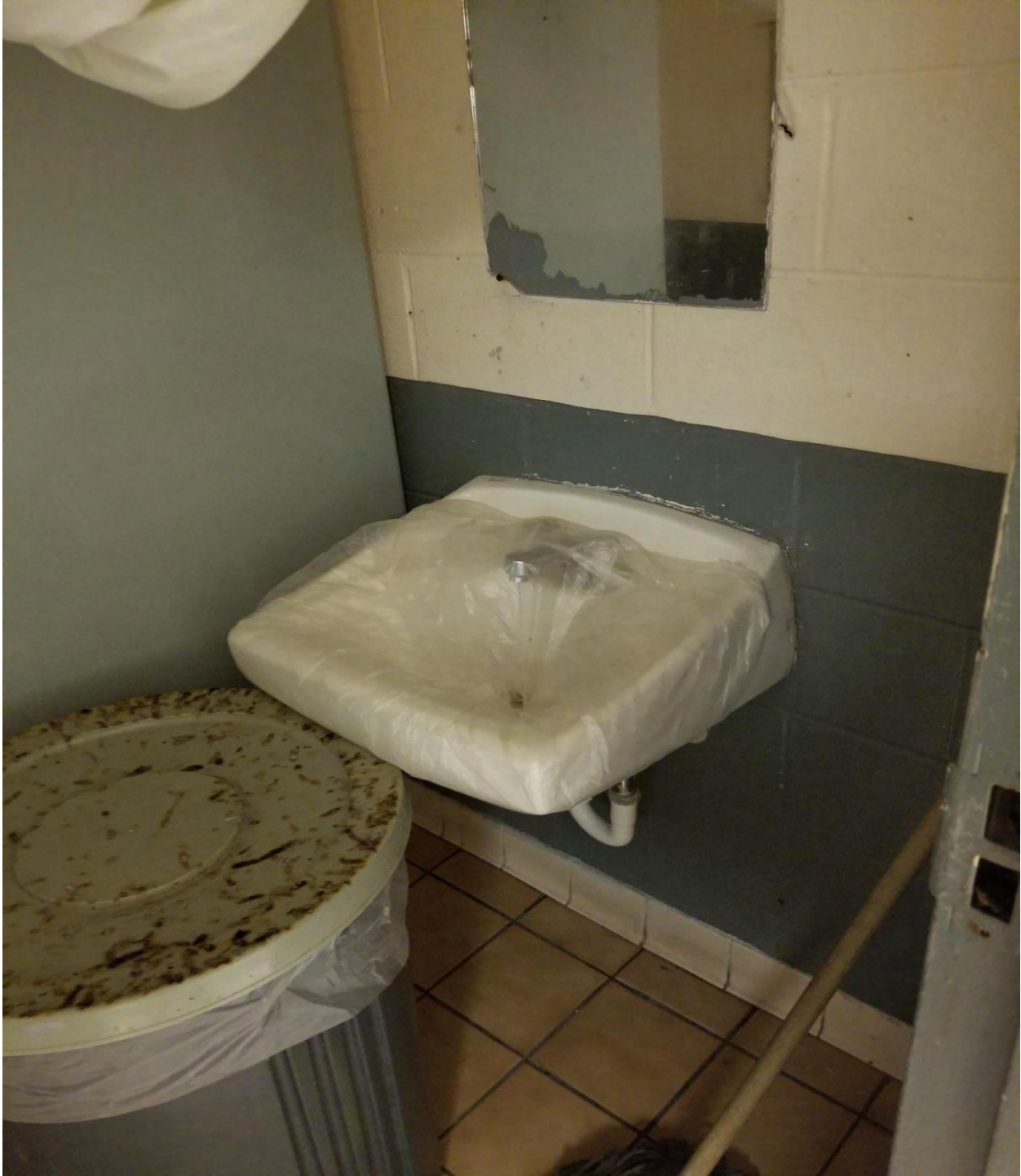
Unit 26 Bldg. B (Zone C) 2 nd lavatory sink does not work