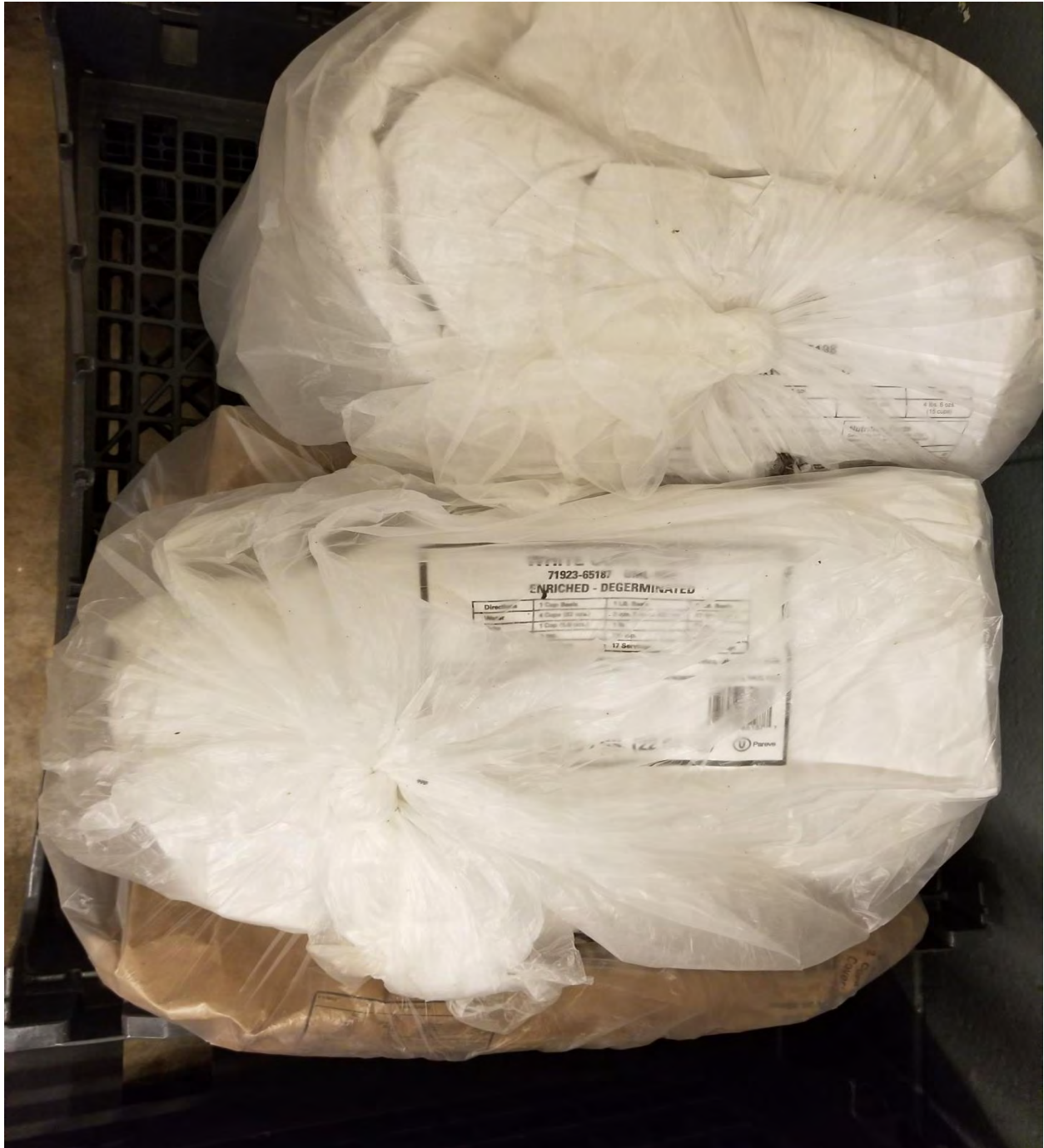
Unit 26 Kitchen Storage Mice droppings inside the bag of grits