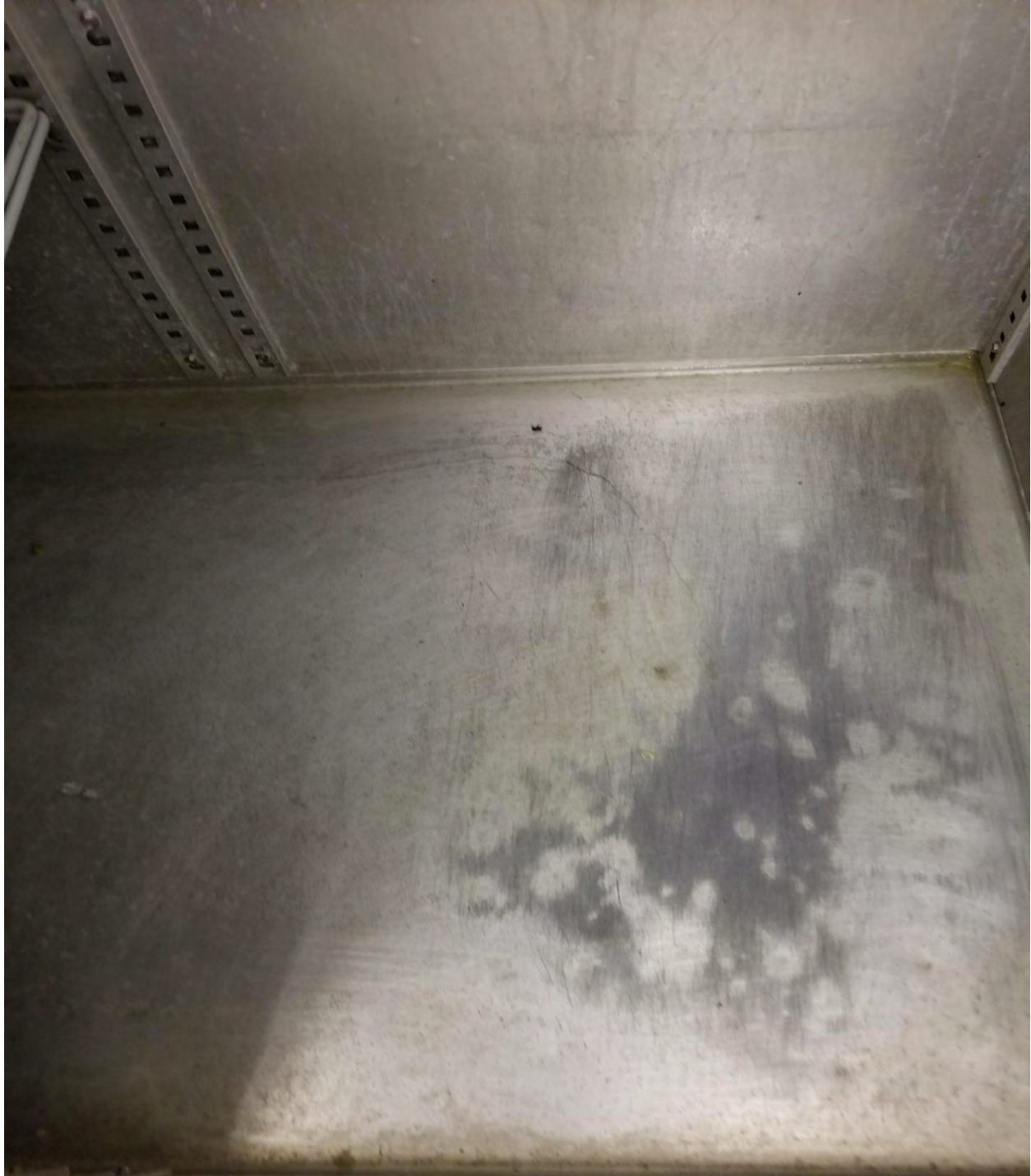
Unit 28 Kitchen Standing water in bottom of cooler with dead flies