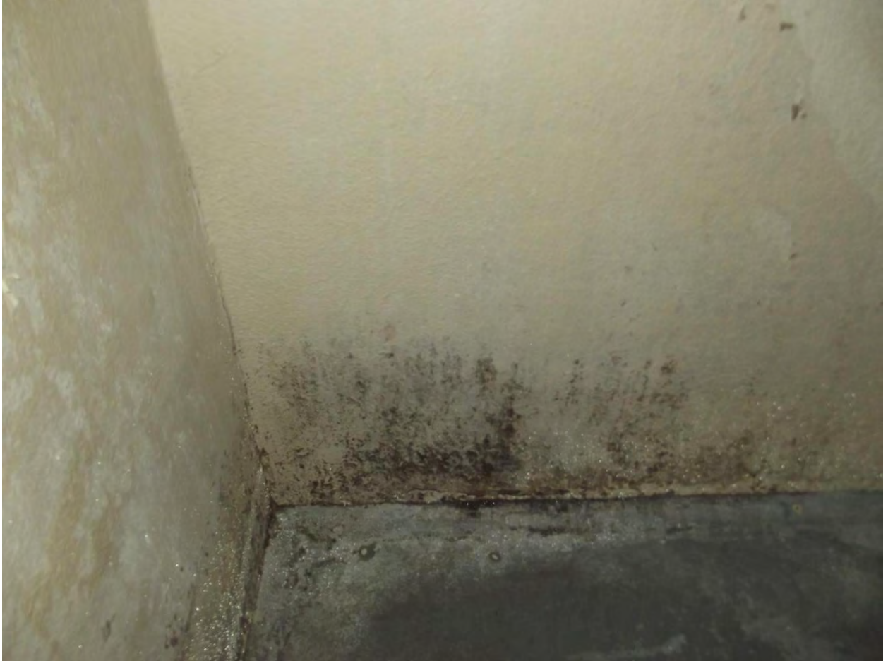
Unit 29 Bldg. A (Zone A) Showers contain mold/mildew