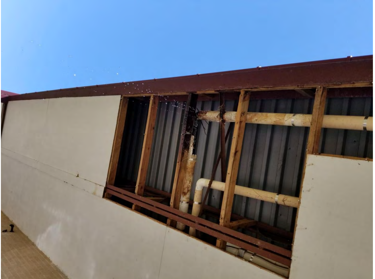
Unit 26 Bldg. B (Zone A) Pipes leak underneath canopy