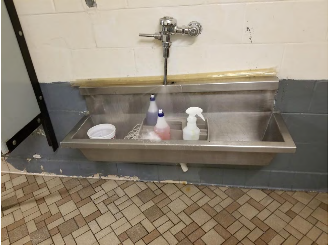
Unit 25 (Zone A) Urinal does not work