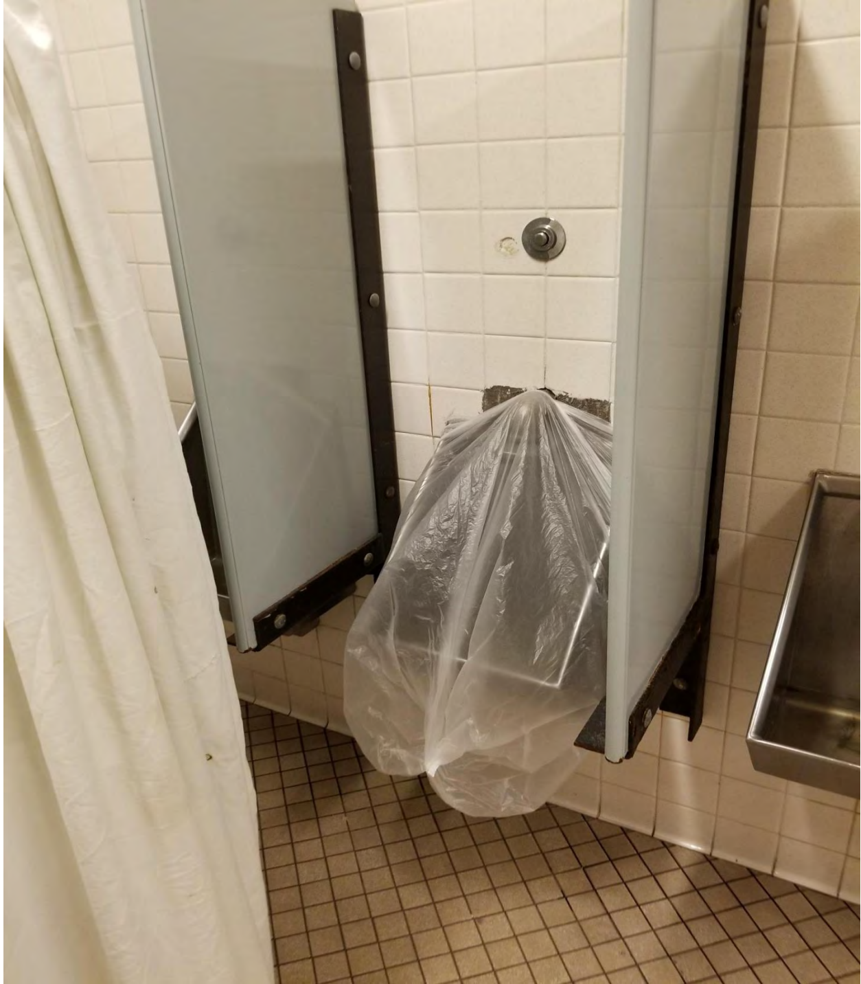
Unit 29 Bldg. B (Zone B) 1 st urinal does not work