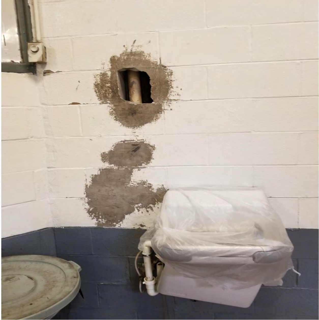
Unit 28 (Zone B) Water fountain does not work and the wall has a hole in it