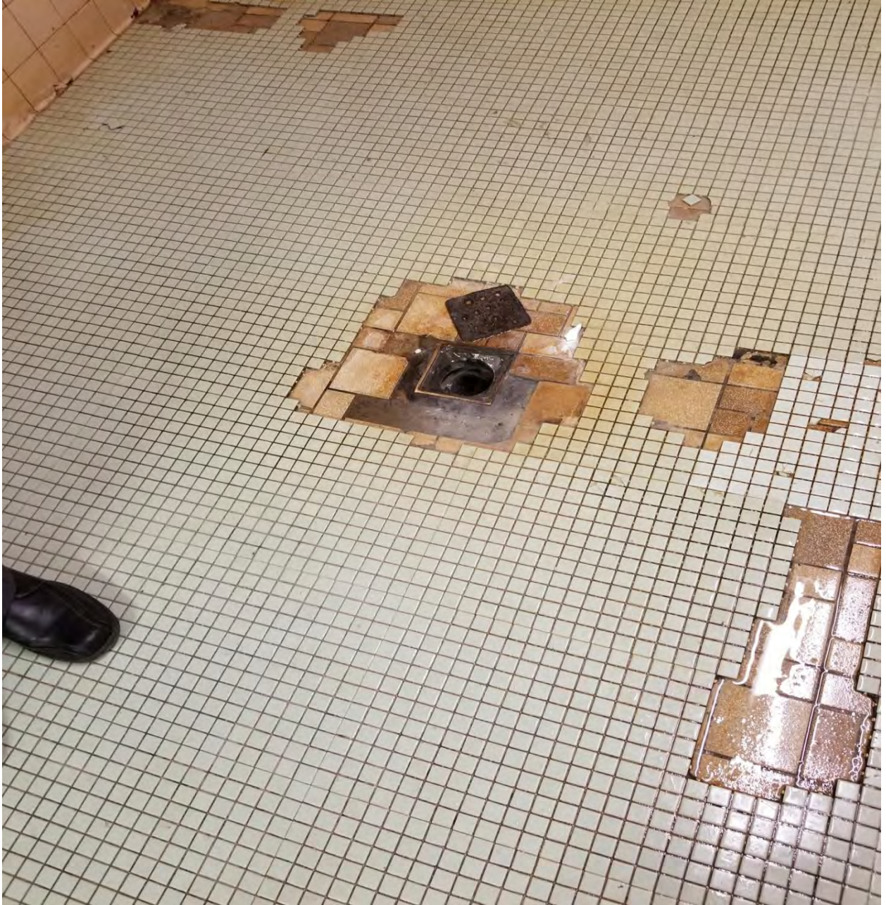
Unit 25 (Zone B) Shower drain cover is missing