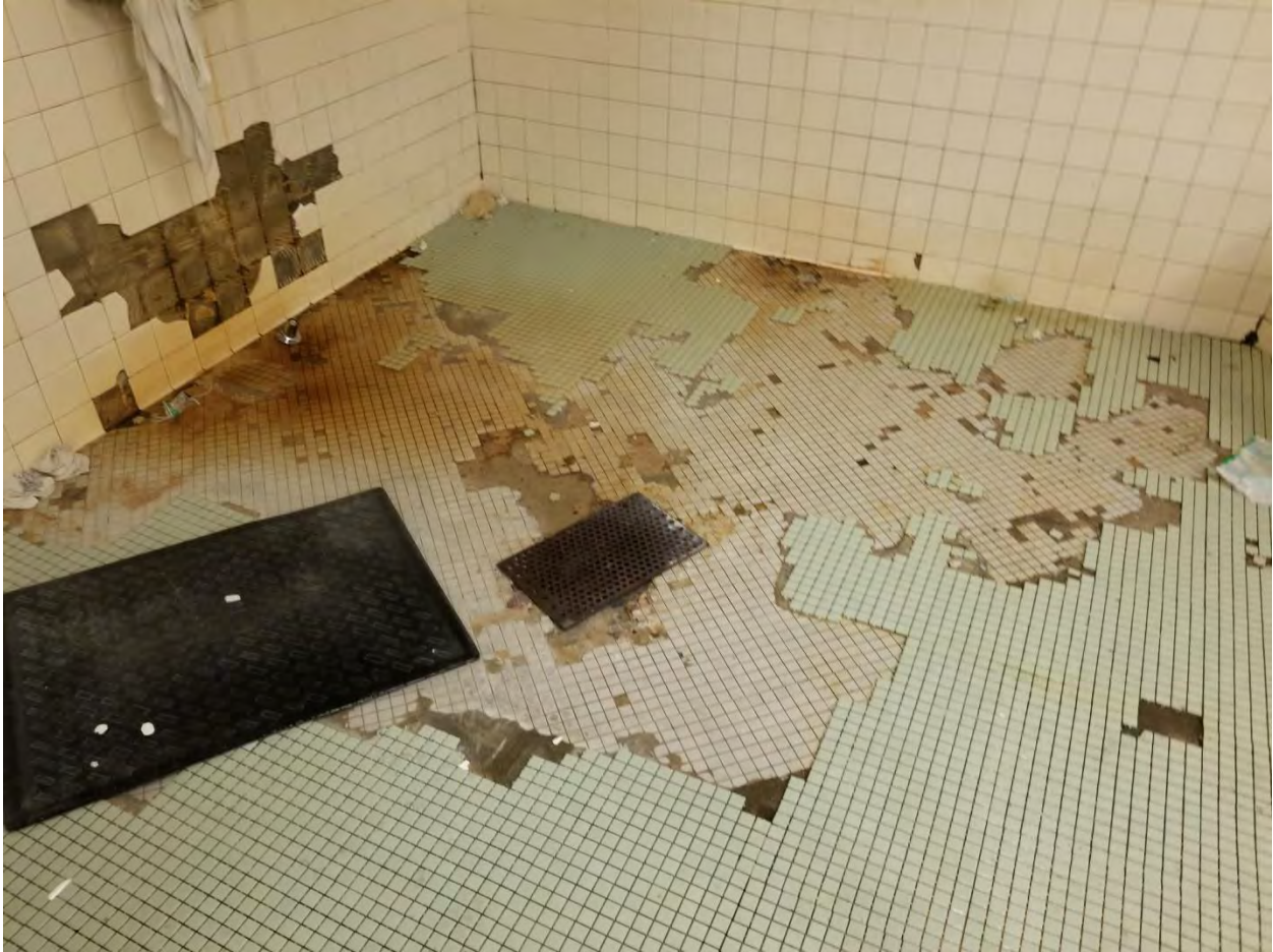
Unit 30 Bldg. B (Zone A) Shower floor has missing tiles