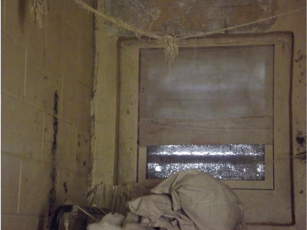
Unit 29 Bldg. G (Zone A) Window screen has holes