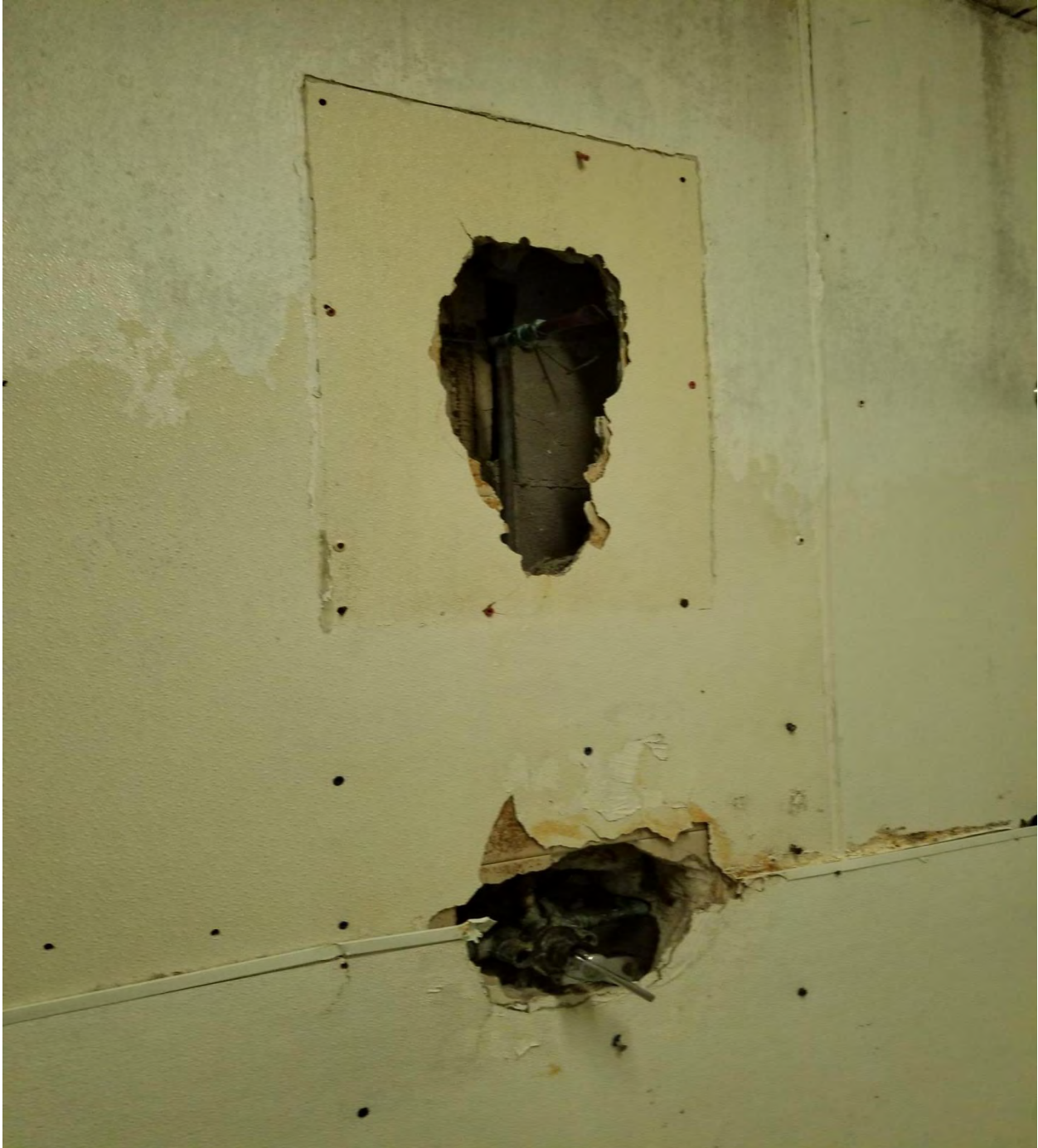
Unit 26 Bldg. A (Zone C) Holes in wall over left middle shower