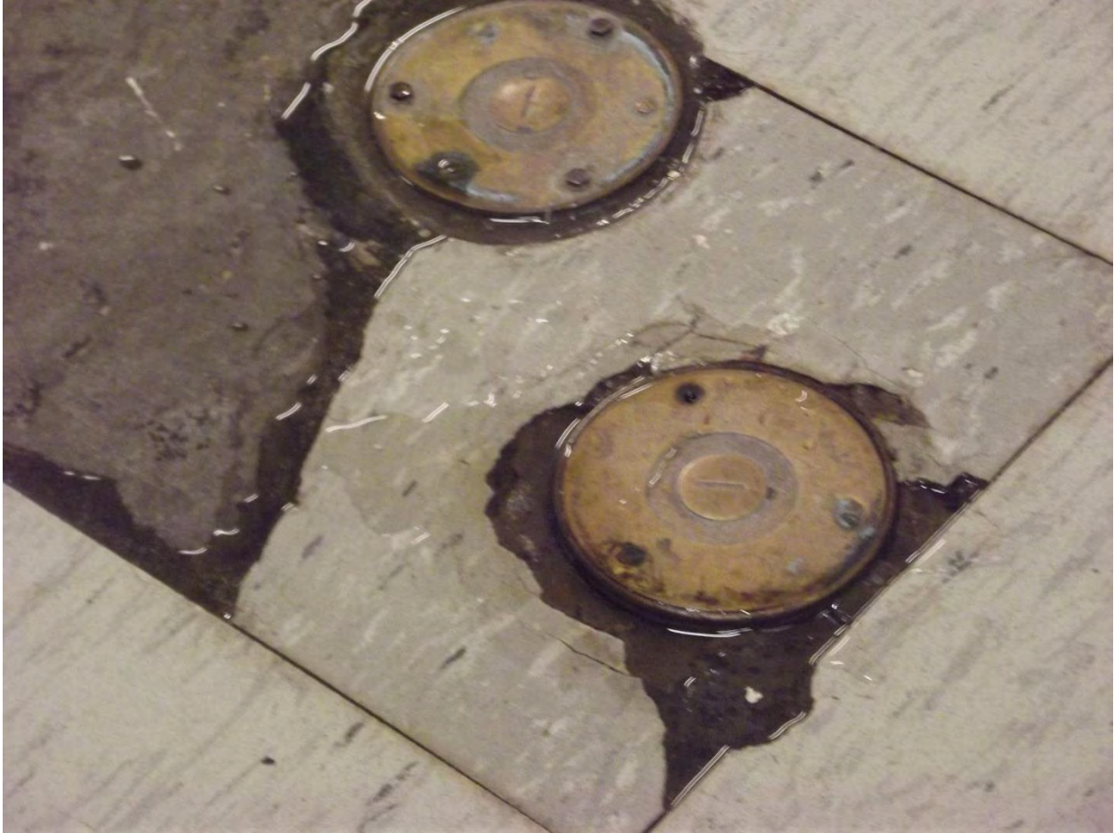
Unit 29 Bldg. B (Zone A) Floor drains backed up and overflowing into the zone