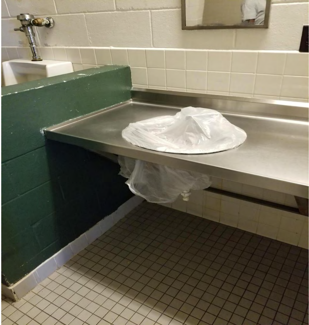
Unit 31 (Zone C) 1 st lavatory sink does not work