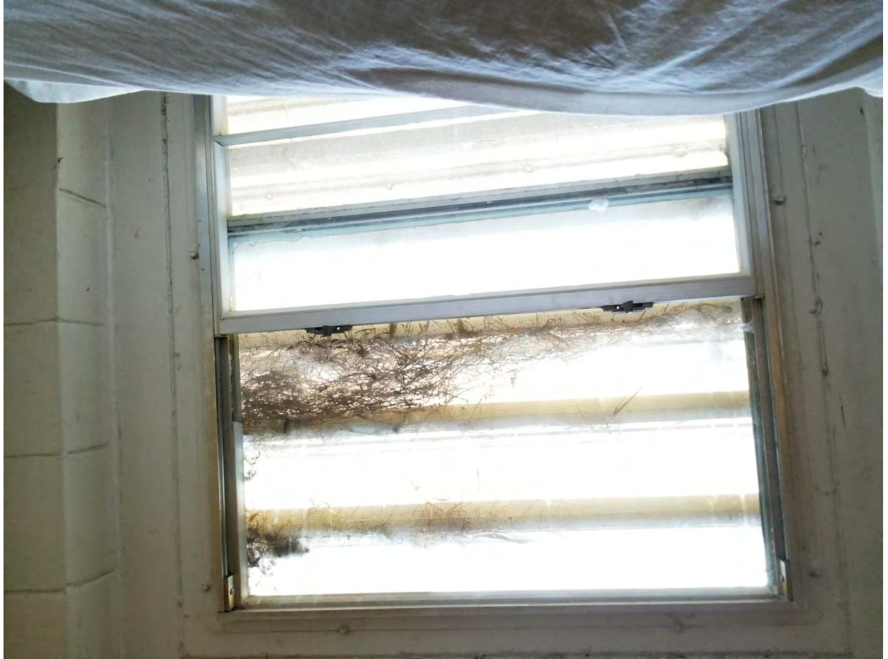
Unit 26 Bldg. A (Zone B) Bed 65 has a bird nest in the window