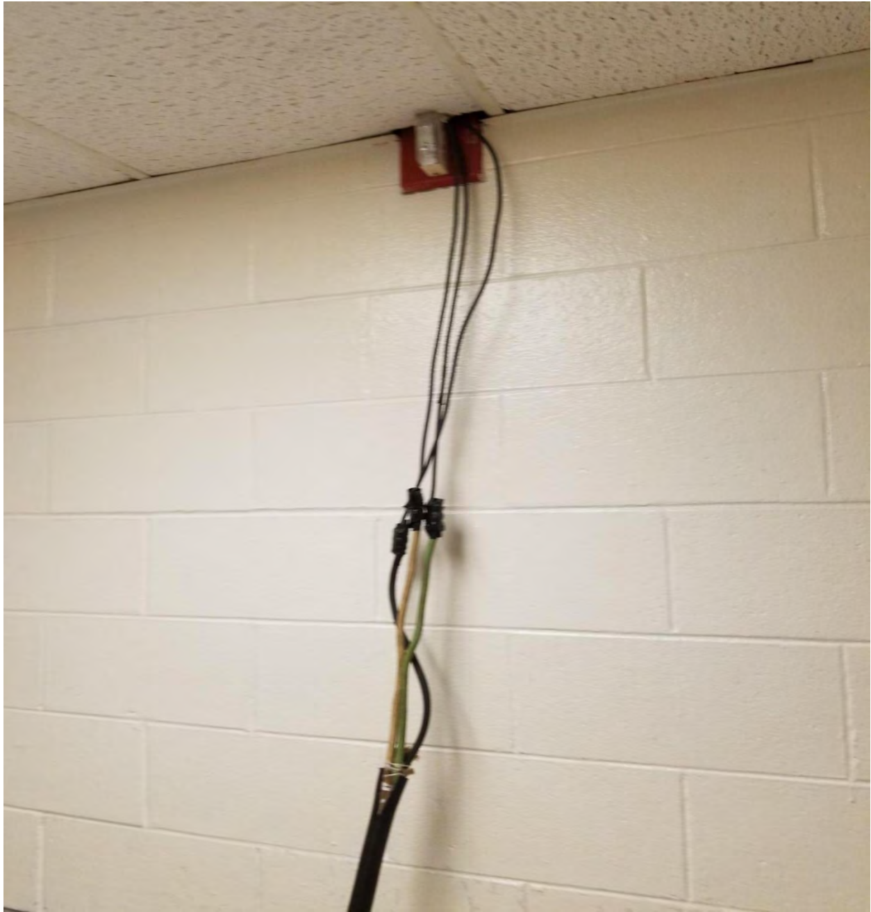
Unit 25 (Zone B) Exposed wires running from the ceiling