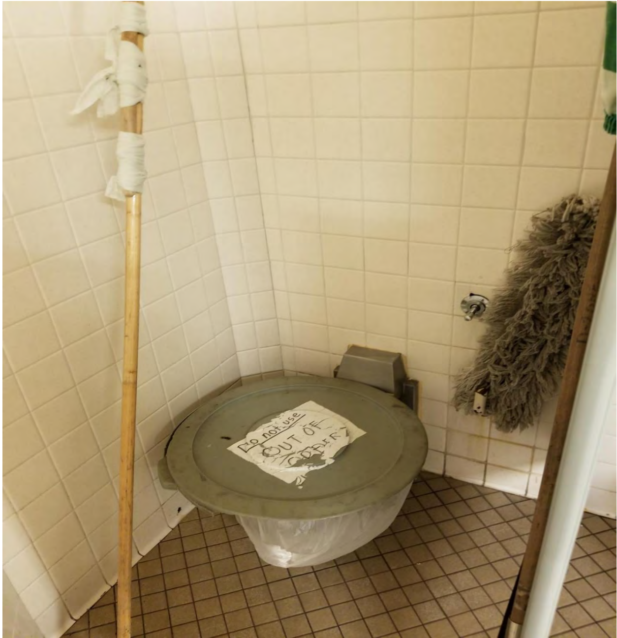
Unit 26 Bldg. A (Zone A) Commode does not work