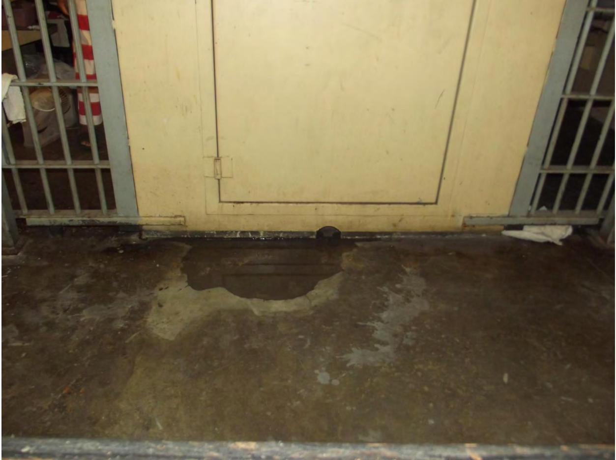
Unit 29 Bldg. K (Zone A) Pipe chase leaks water between cells #12 and #13