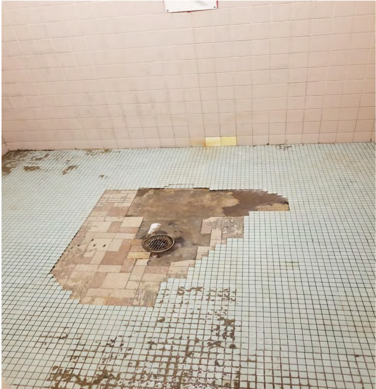
Unit 30 Bldg. A (Zone B) Shower floor has missing tiles