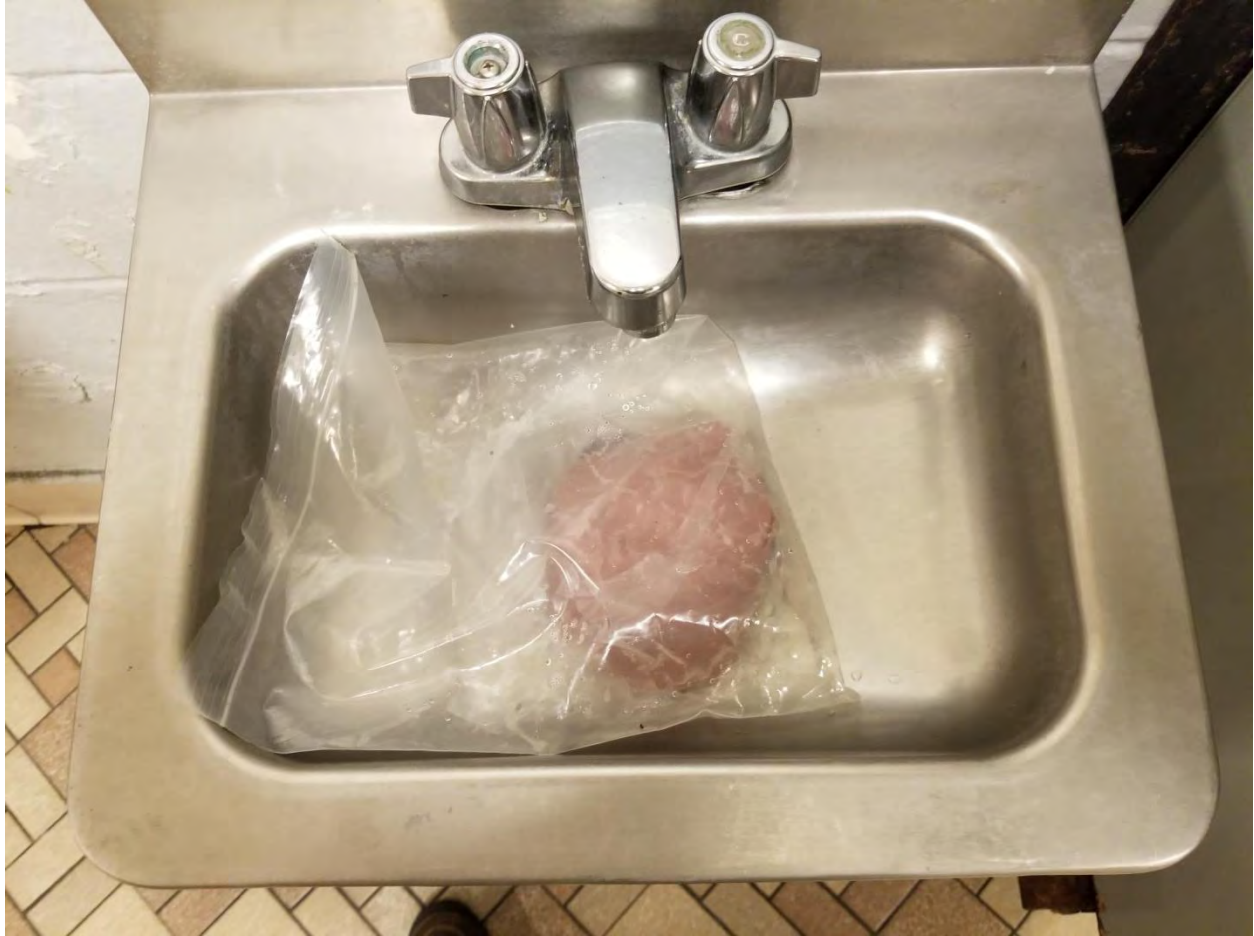
Unit 26 Bldg. A (Zone C) 5 th lavatory sink contained bologna