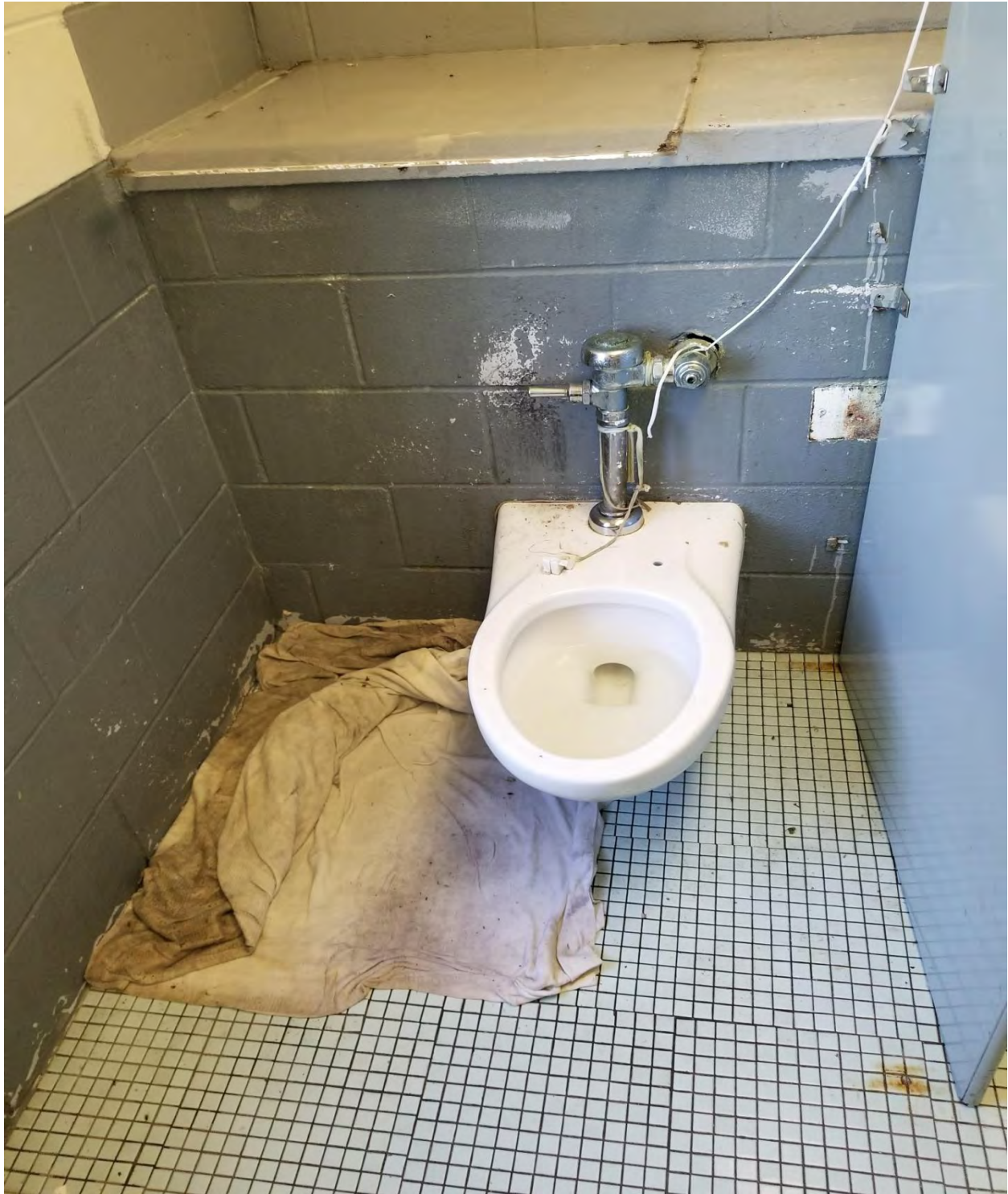
Unit 26 Bldg. B (Zone E) 1 st commode has a leak