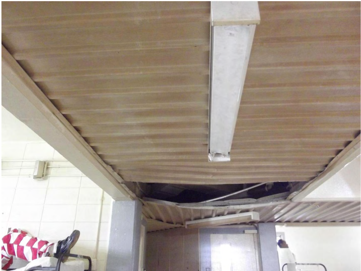
Unit 29 Bldg. C (Zone A) Ceiling panel has been removed