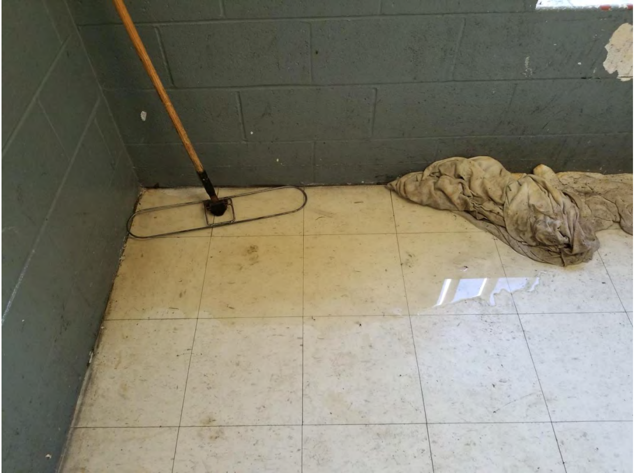
Unit 26 Bldg. B (Zone E) Water leaks through the wall