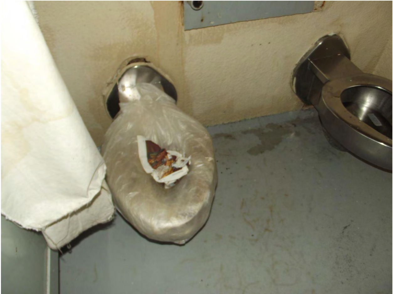
Unit 29 Bldg. D (Zone B) 2 nd Commode does not work