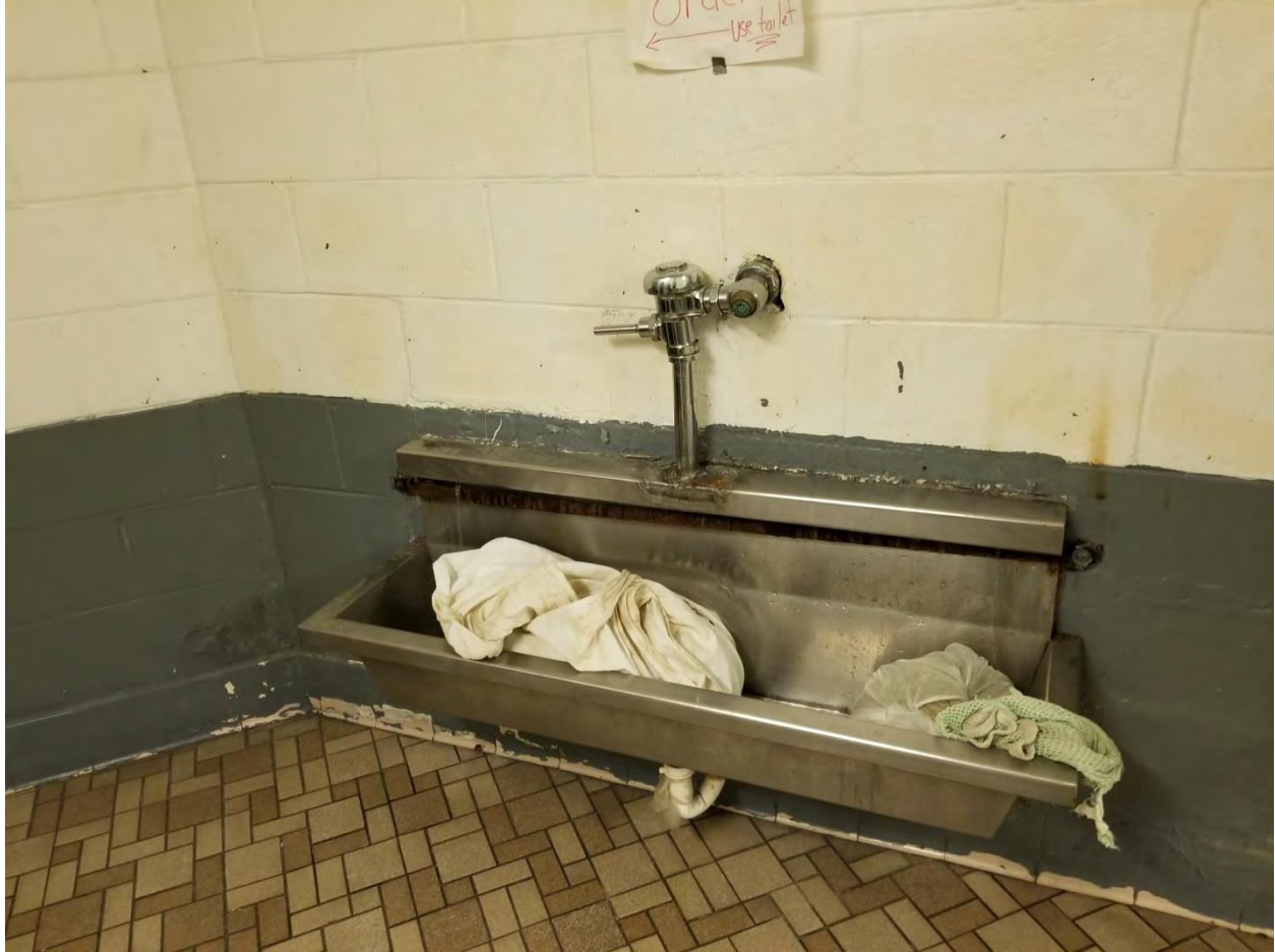
Unit 25 (Zone B) Urinal does not work