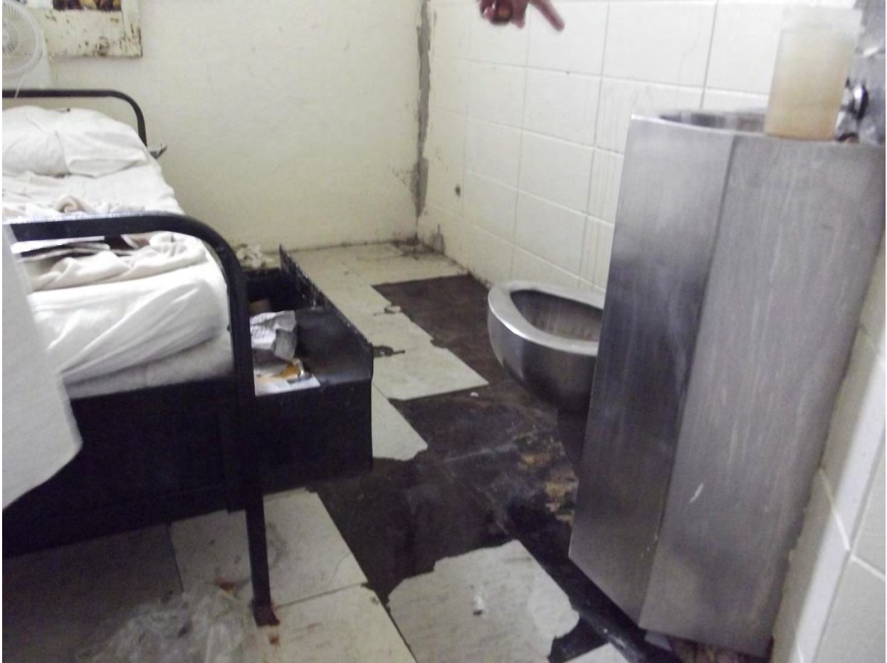
Unit 29 Bldg. A (Zone A) Commode leaking inside the cell