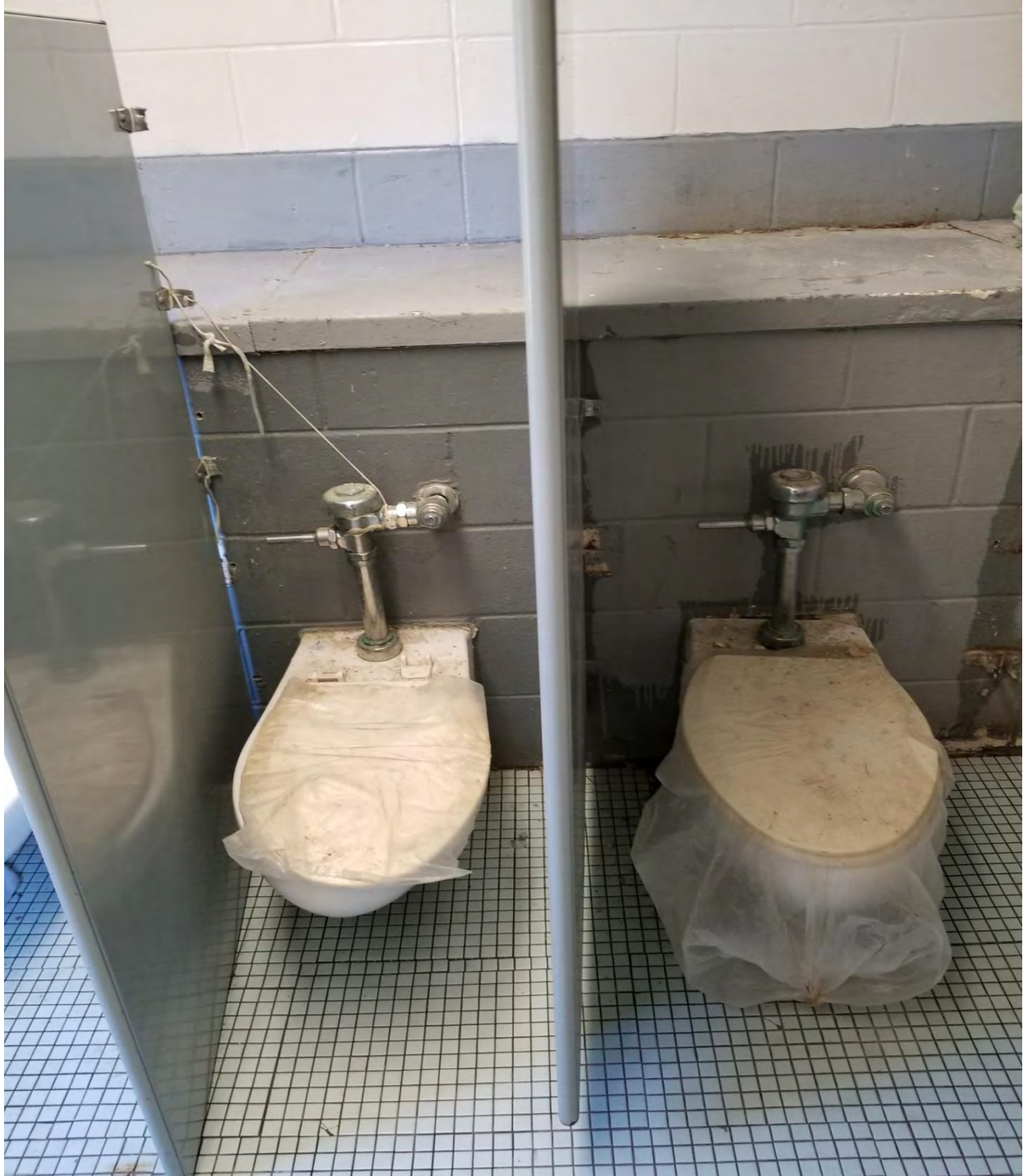
Unit 30 Bldg. A (Zone A) 1 st and 2 nd commodes do not work