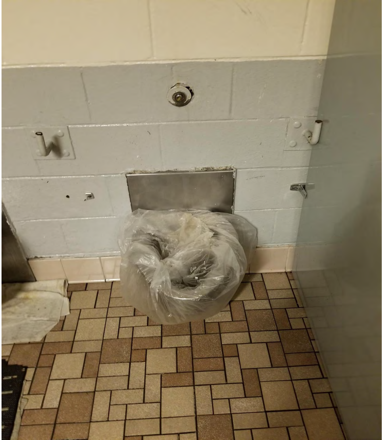
Unit 25 (Zone A) 1 st commode does not work