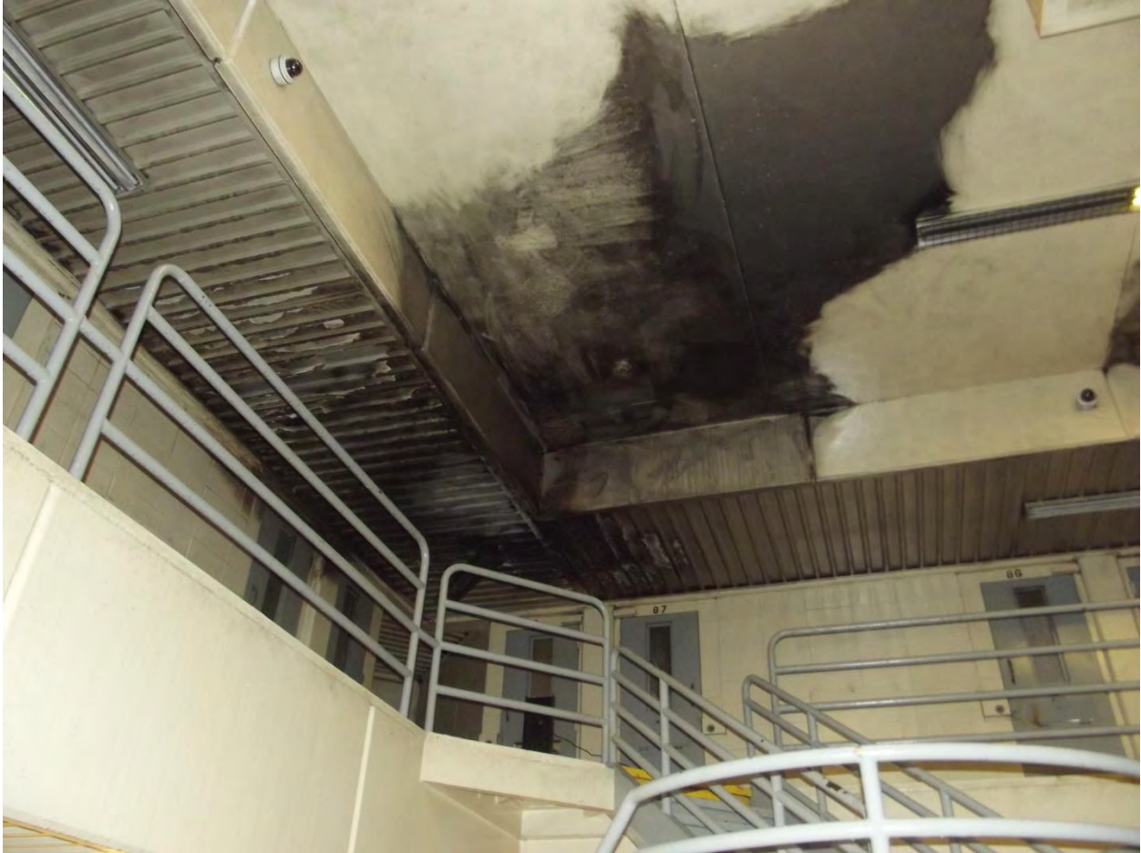
Unit 29 Bldg. A (Zone A) Fire Damage to the ceiling