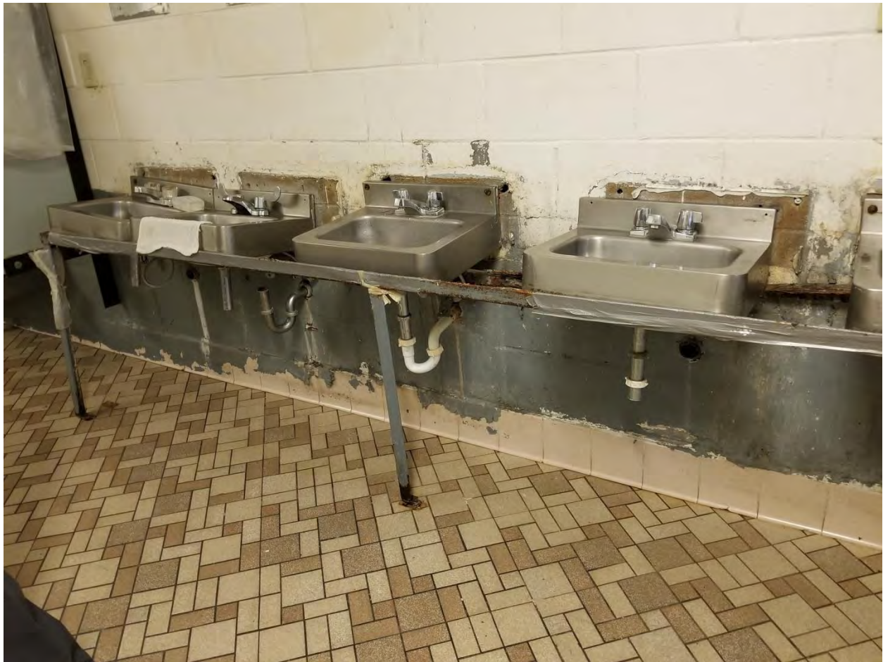
Unit 25 (Zone A) 2 nd and 4 th lavatory sinks do not work