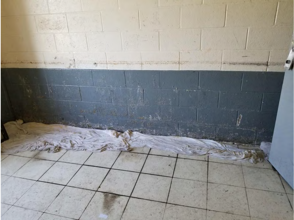
Unit 26 Bldg. B (Zone E) Water leaks through the wall