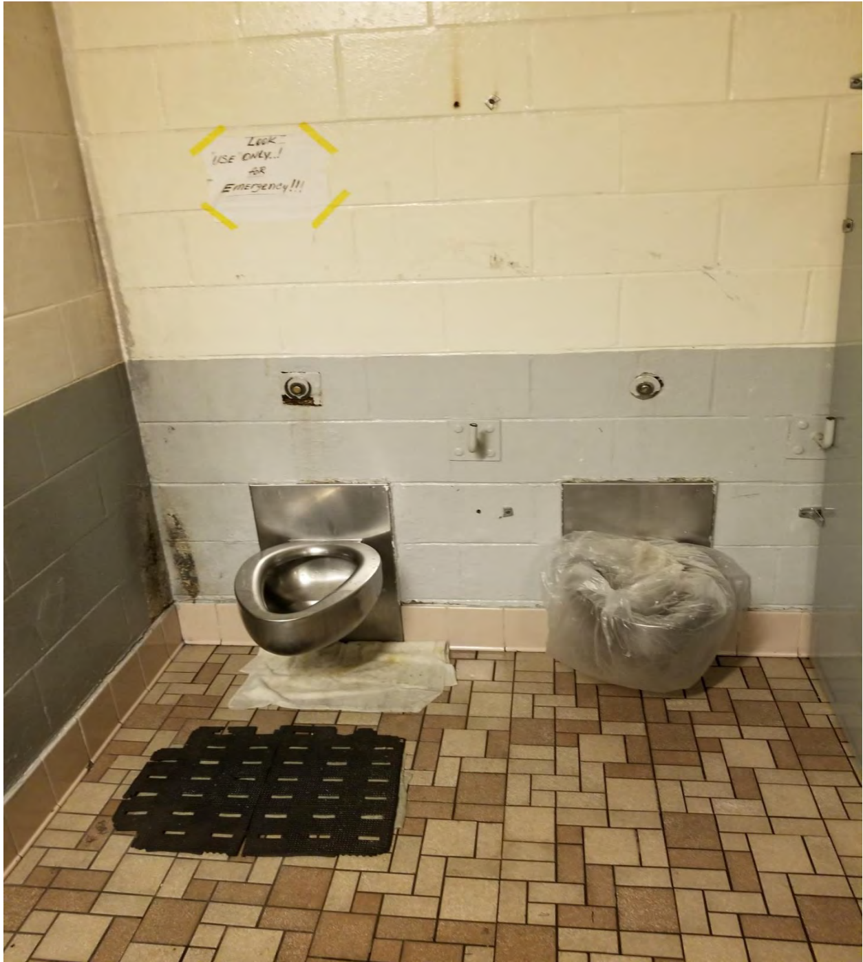
Unit 26 Bldg. A (Zone D) 1 st commode has a leak and 2 nd commode does not work