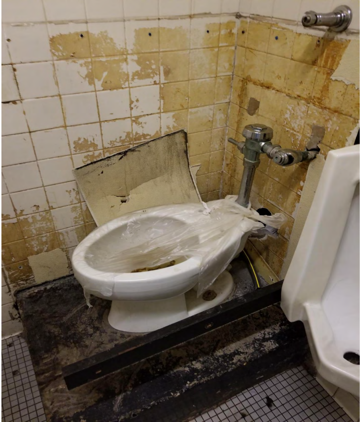
Unit 30 Bldg. A (Zone A) Commode on back wall does not work