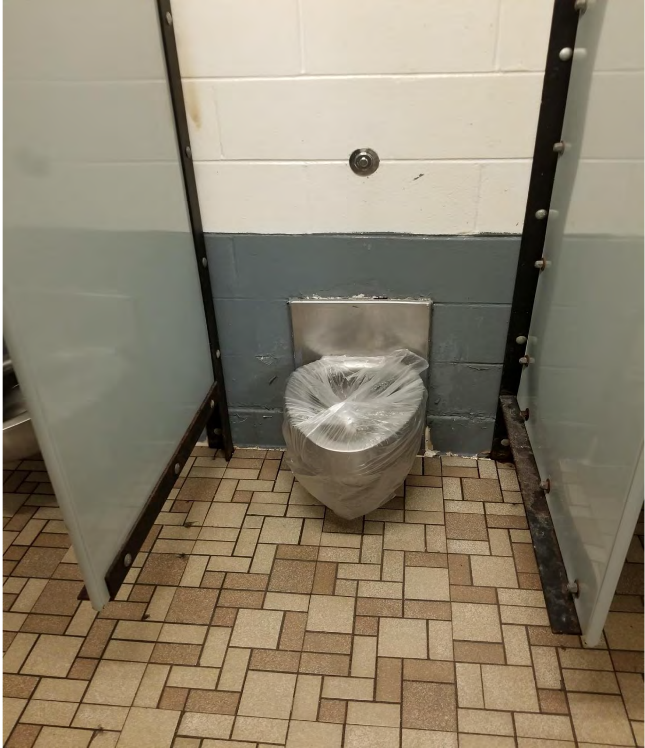
Unit 25 (Zone B) 2 nd commode does not work