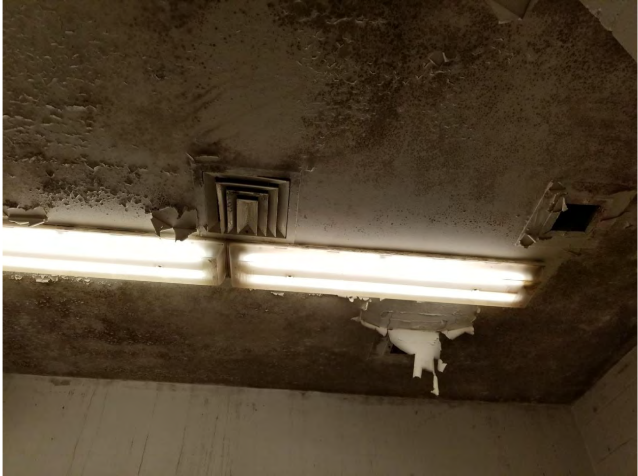
Unit 31 (Zone C) Shower ceiling has mold/mildew and paint peeling