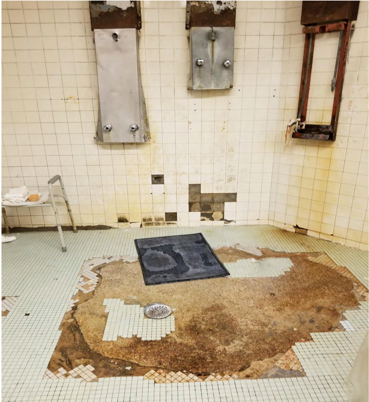
Unit 30 Bldg. B (Zone A) Shower floor has missing tiles