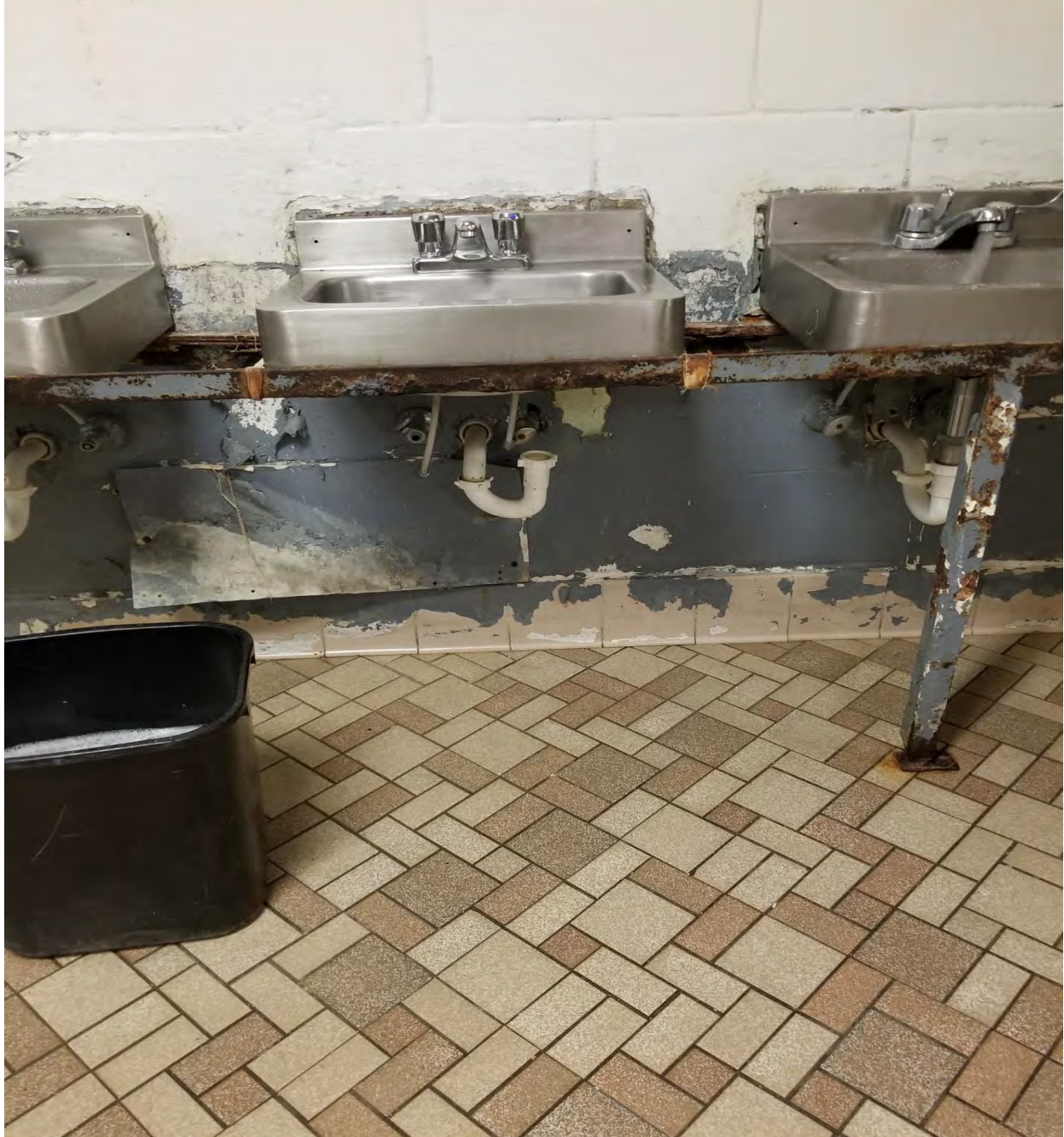
Unit 25 (Zone B) 3 rd lavatory sink is missing pipes