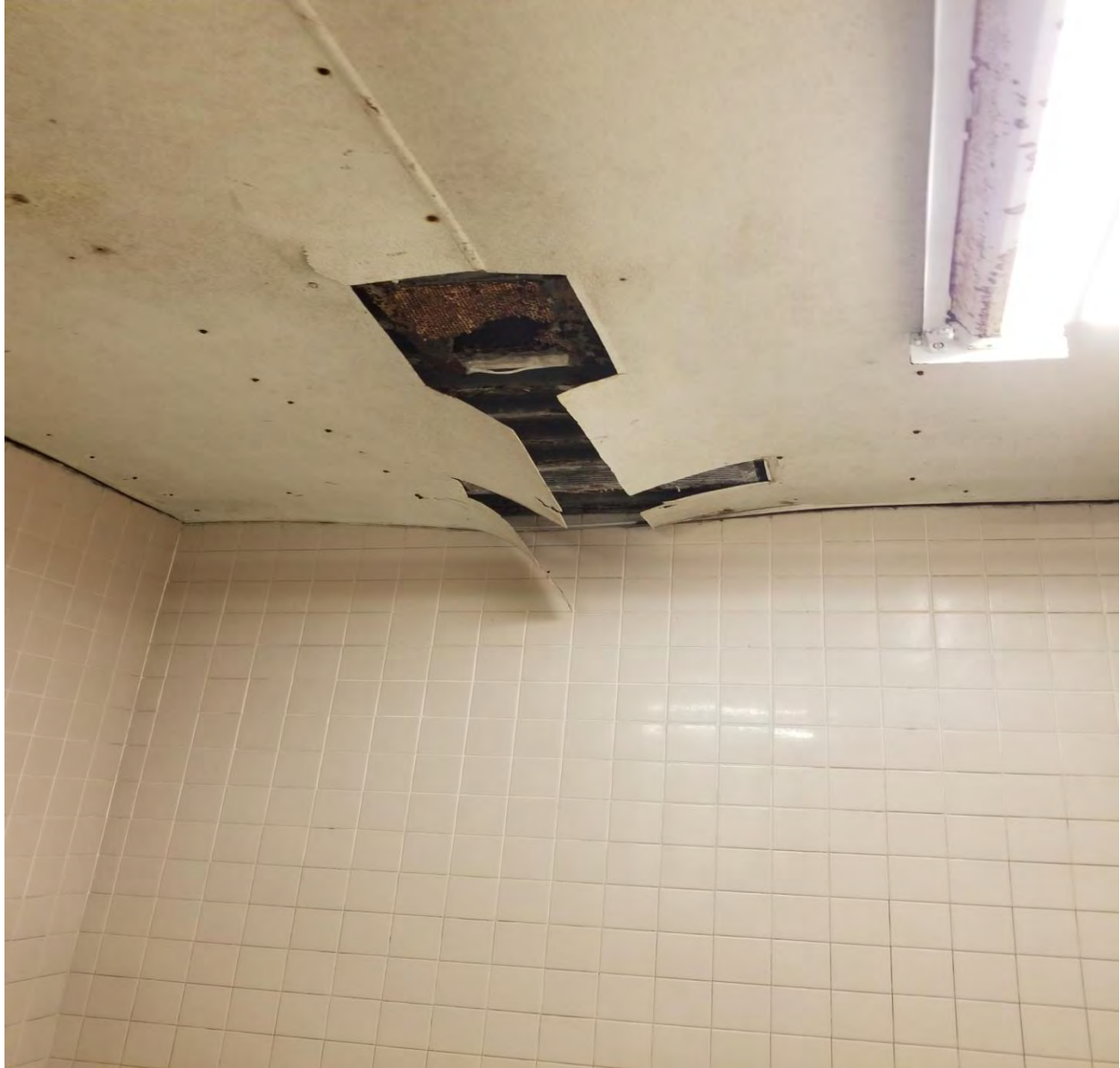
Unit 25 (Zone B) Shower has a hole in the ceiling