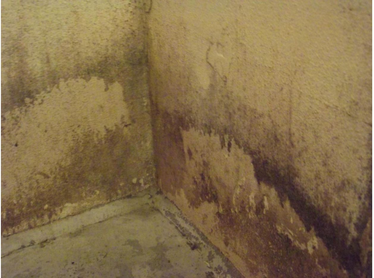
Unit 29 Bldg. A (Zone A) Showers contain mold/mildew