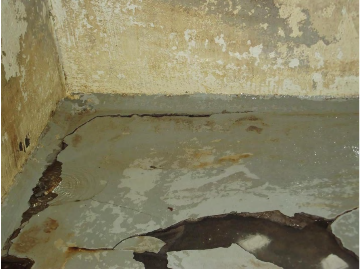
Unit 29 Bldg. G (Zone B) Shower has paint peeling, broken concrete floor and water will not drain