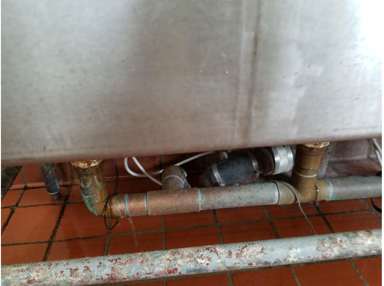
Unit 28 Kitchen Leak underneath 3 compartment sink