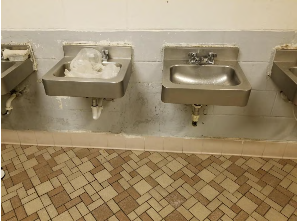
Unit 26 Bldg. A (Zone E) 2 nd lavatory sink does not work