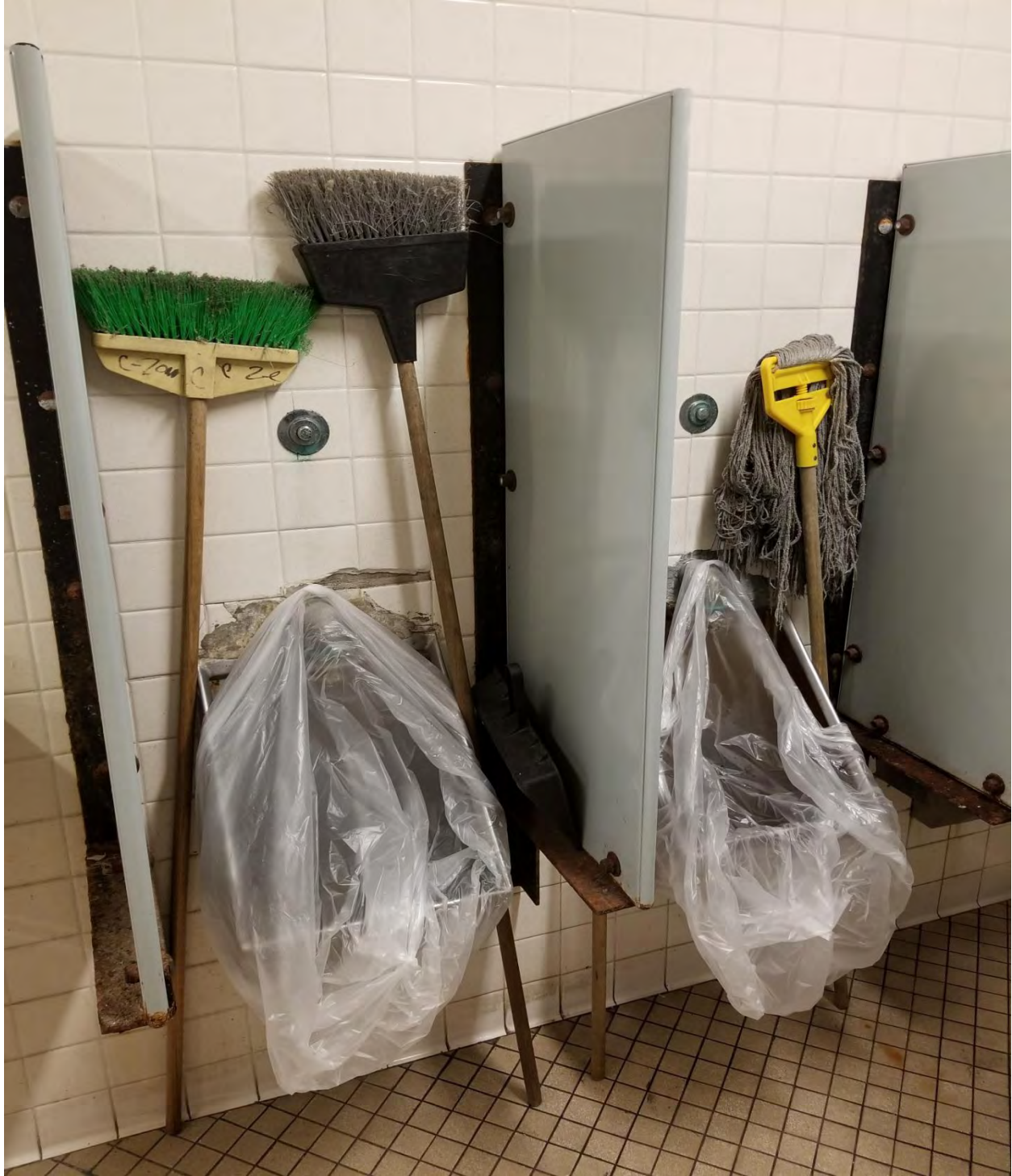
Unit 26 Bldg. A (Zone B) 1 st and 2 nd urinals do not work