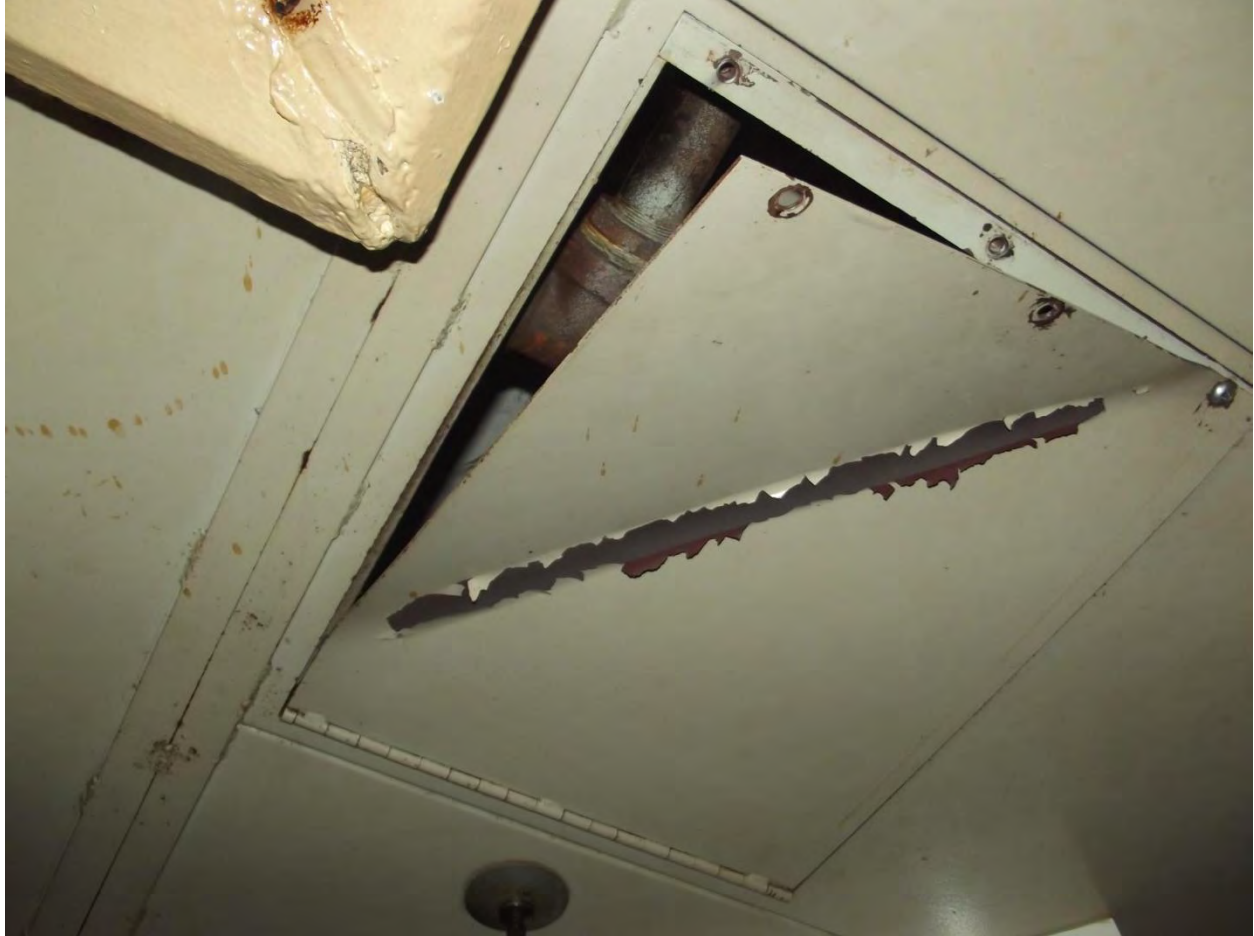
Unit 29 Bldg. H (Zone A) Ceiling panel metal is hanging between cells #8 and #9