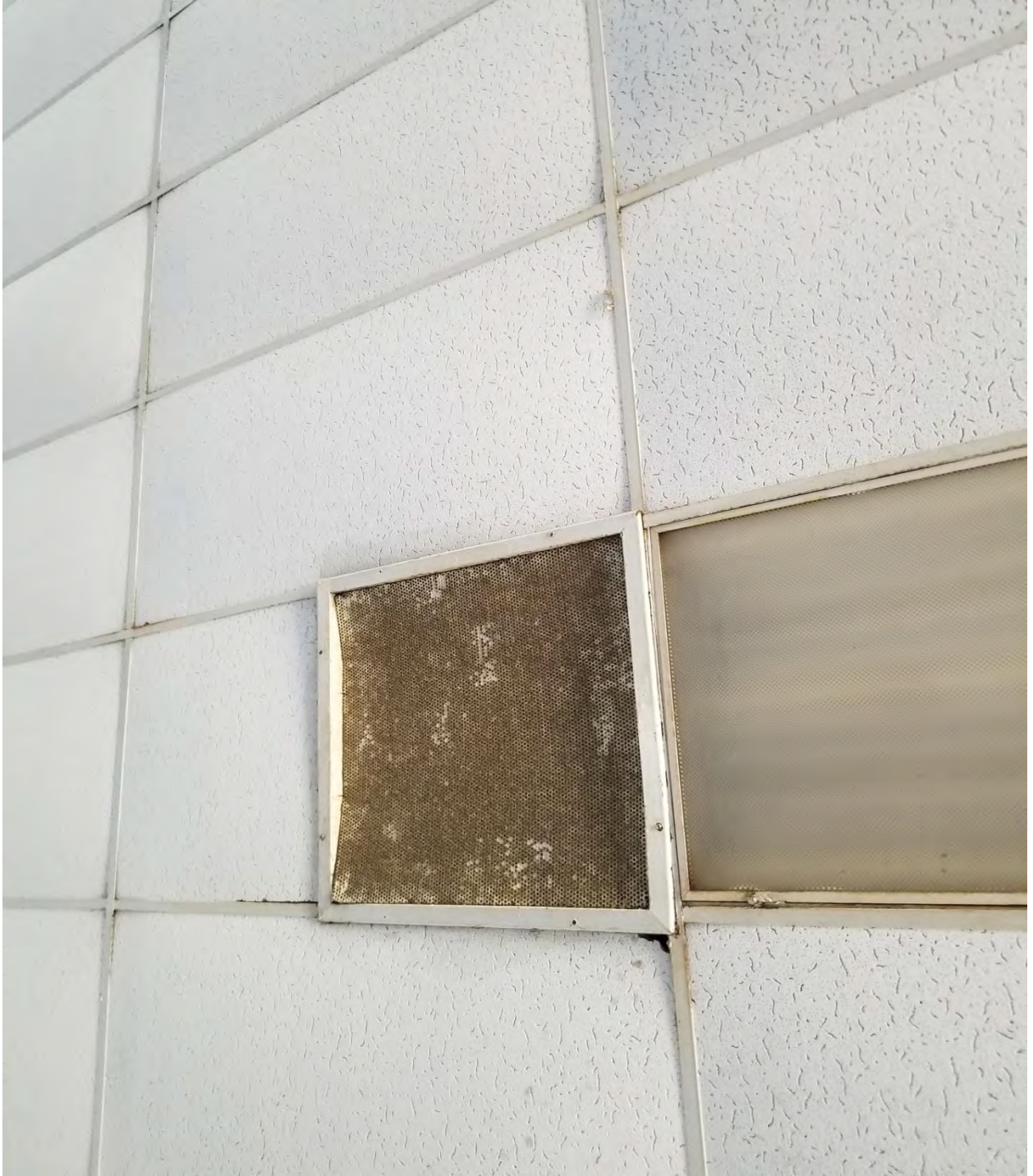
Unit 28 Kitchen Vents in the dining hall needs cleaning