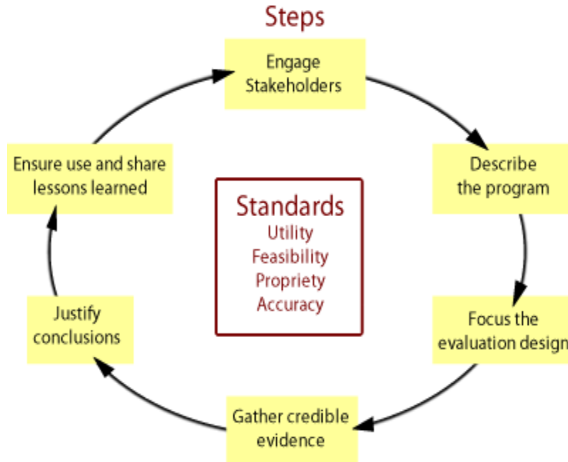
Graphic 2: CDC Framework for Program Evaluation