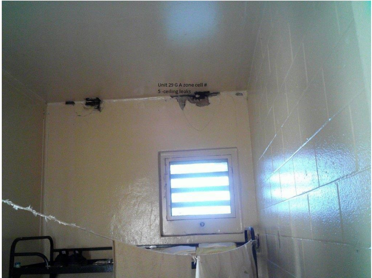
Ceiling has a leak