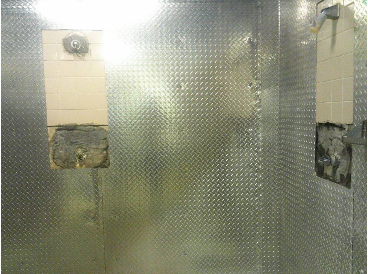
Showers under construction