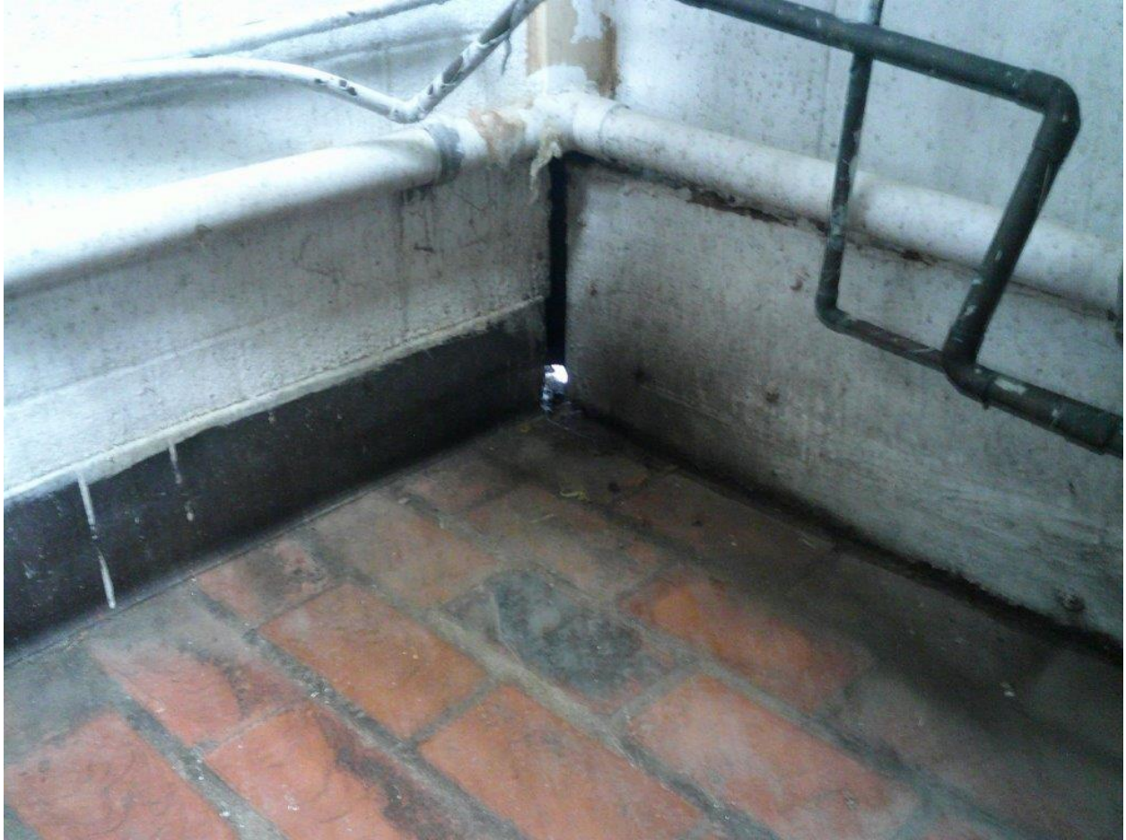
Hole in kitchen wall in the dish wash area