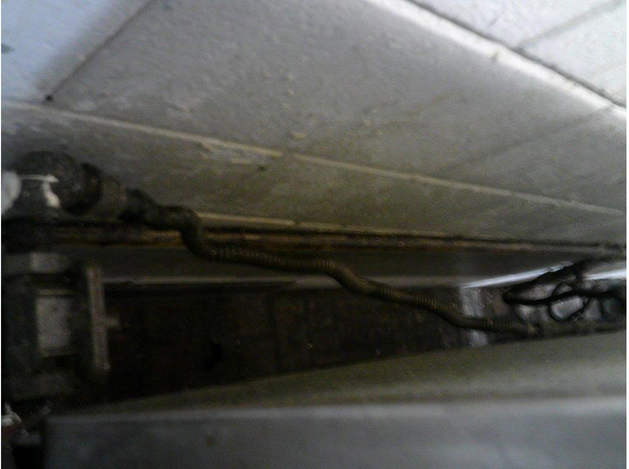
Grease buildup behind kitchen oven