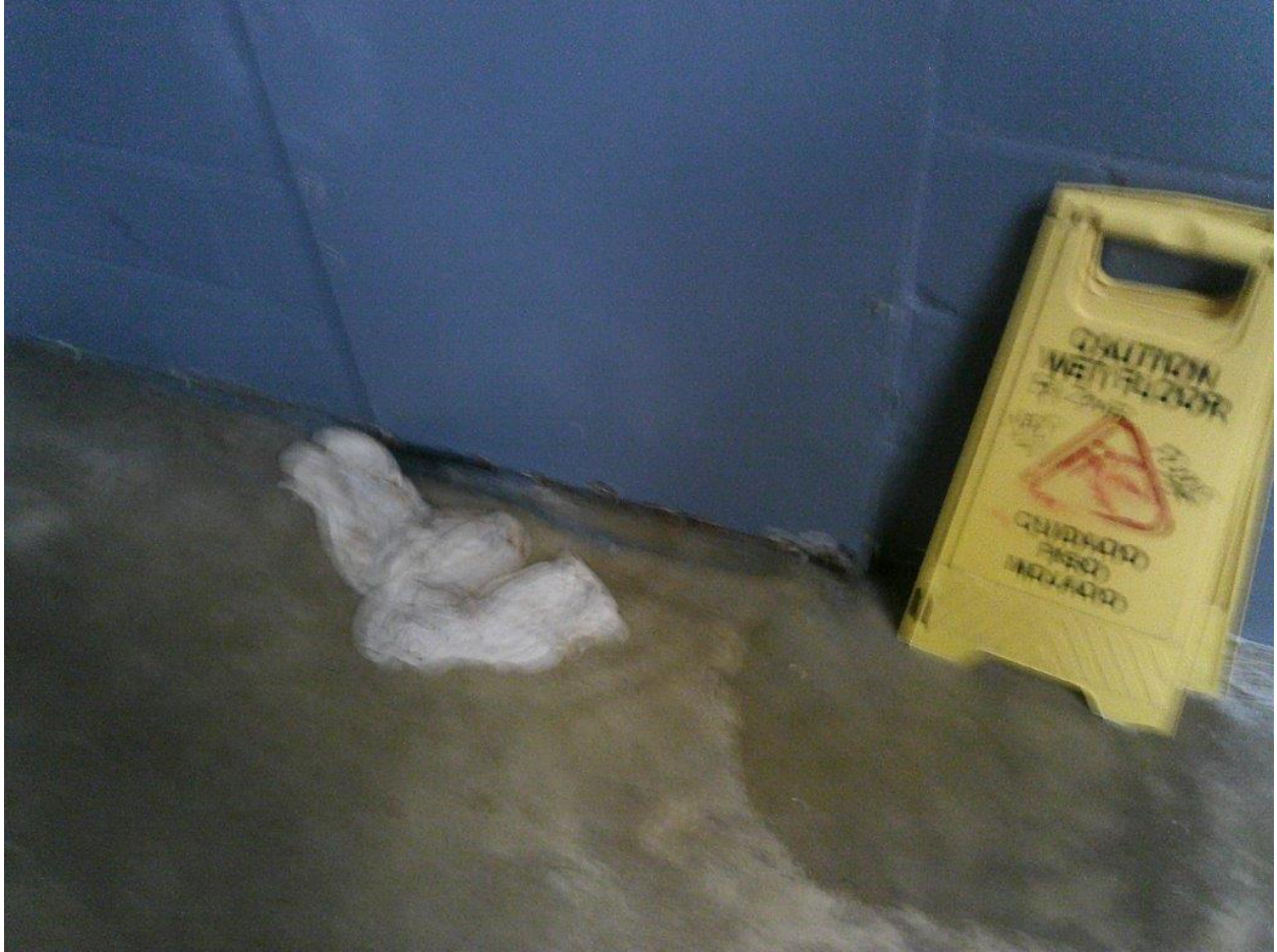
Water leaking from inside the pipe chase