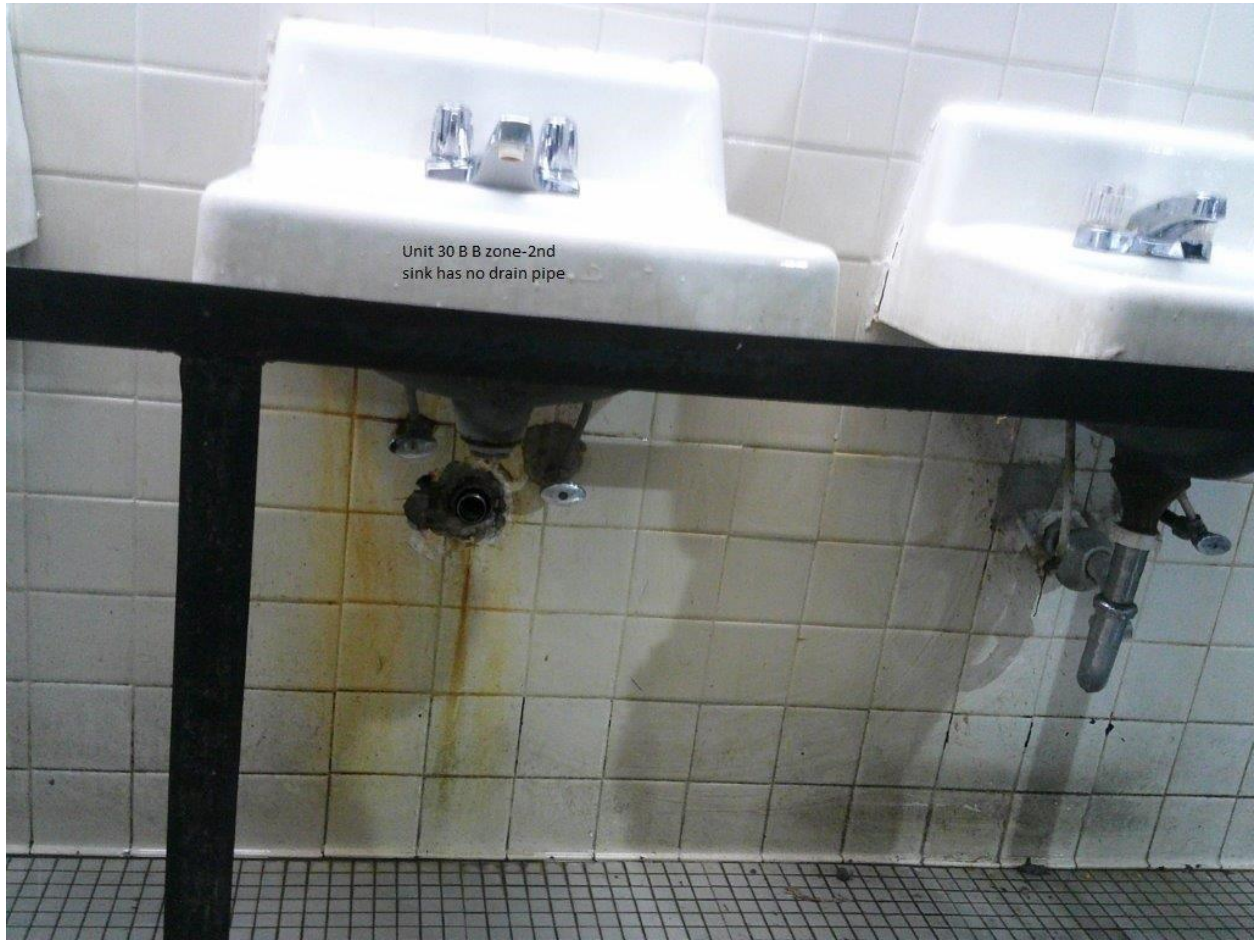
Lavatory sink missing the drain pipes