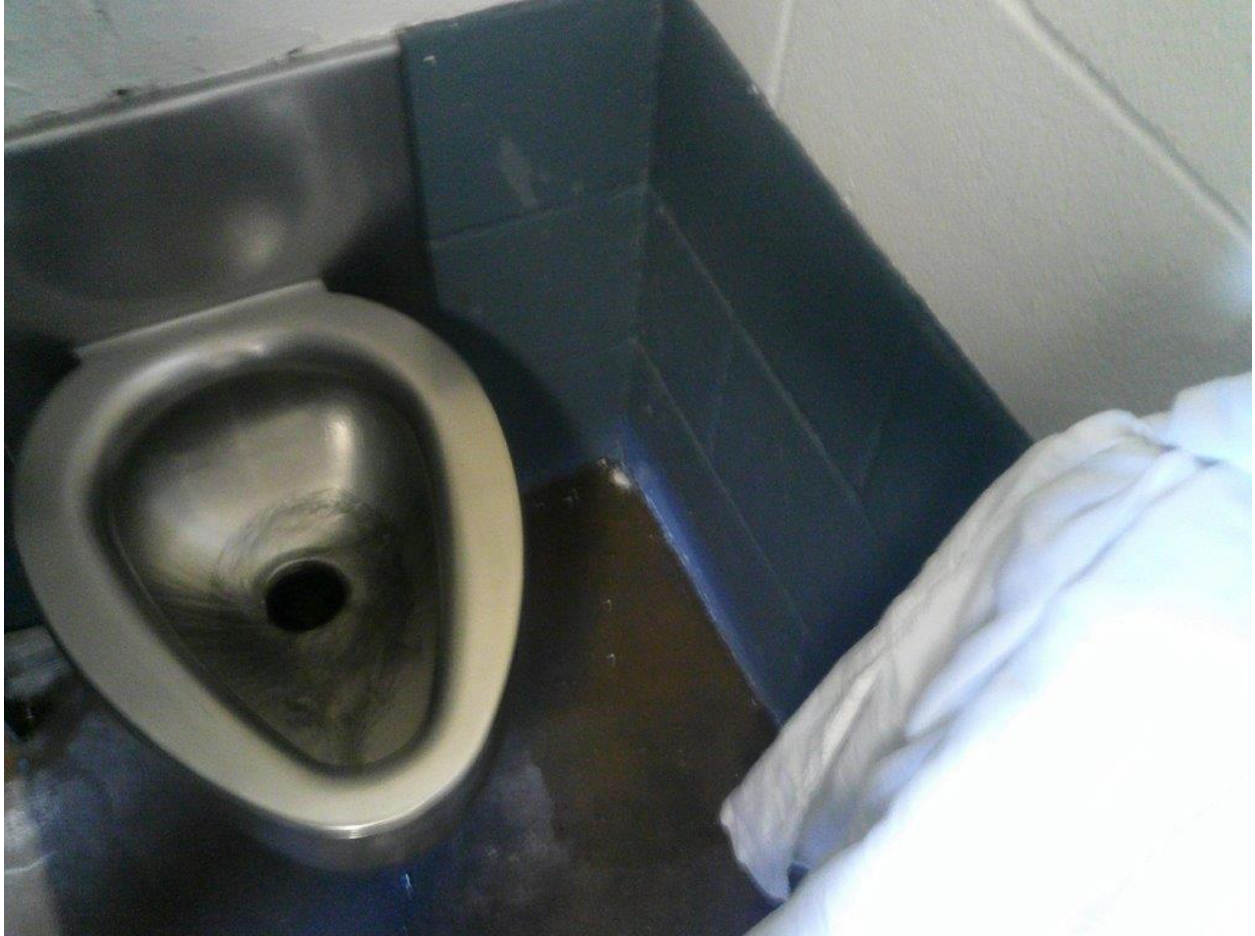
Commode leaking water