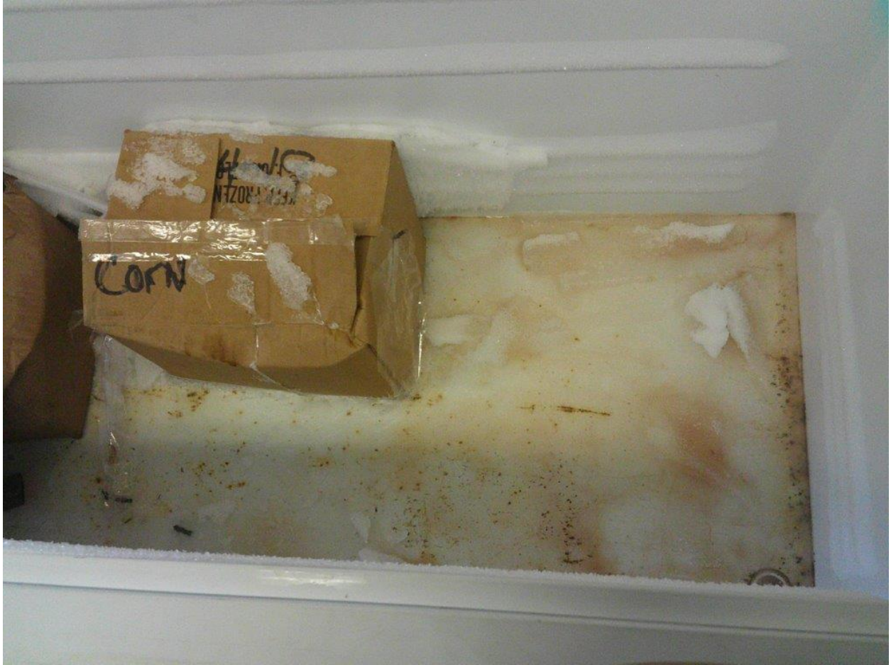
Freezer with vegetables in thawed water from raw meats (Cross-Contamination)