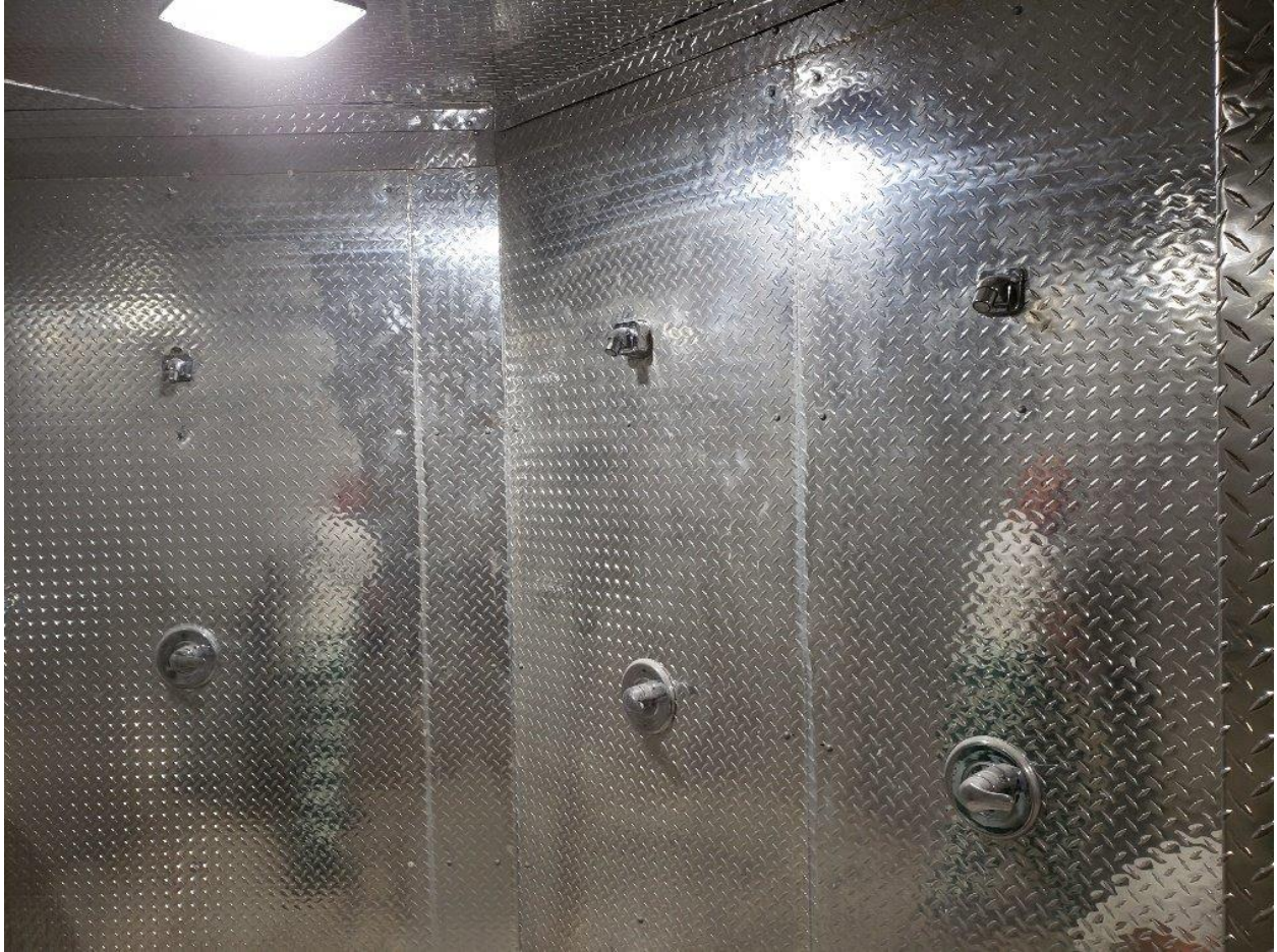
Showers remodeled since last inspection