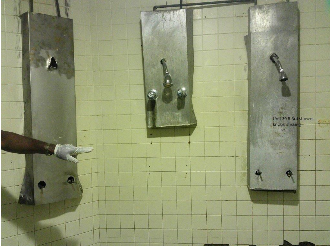
Showers missing the knobs