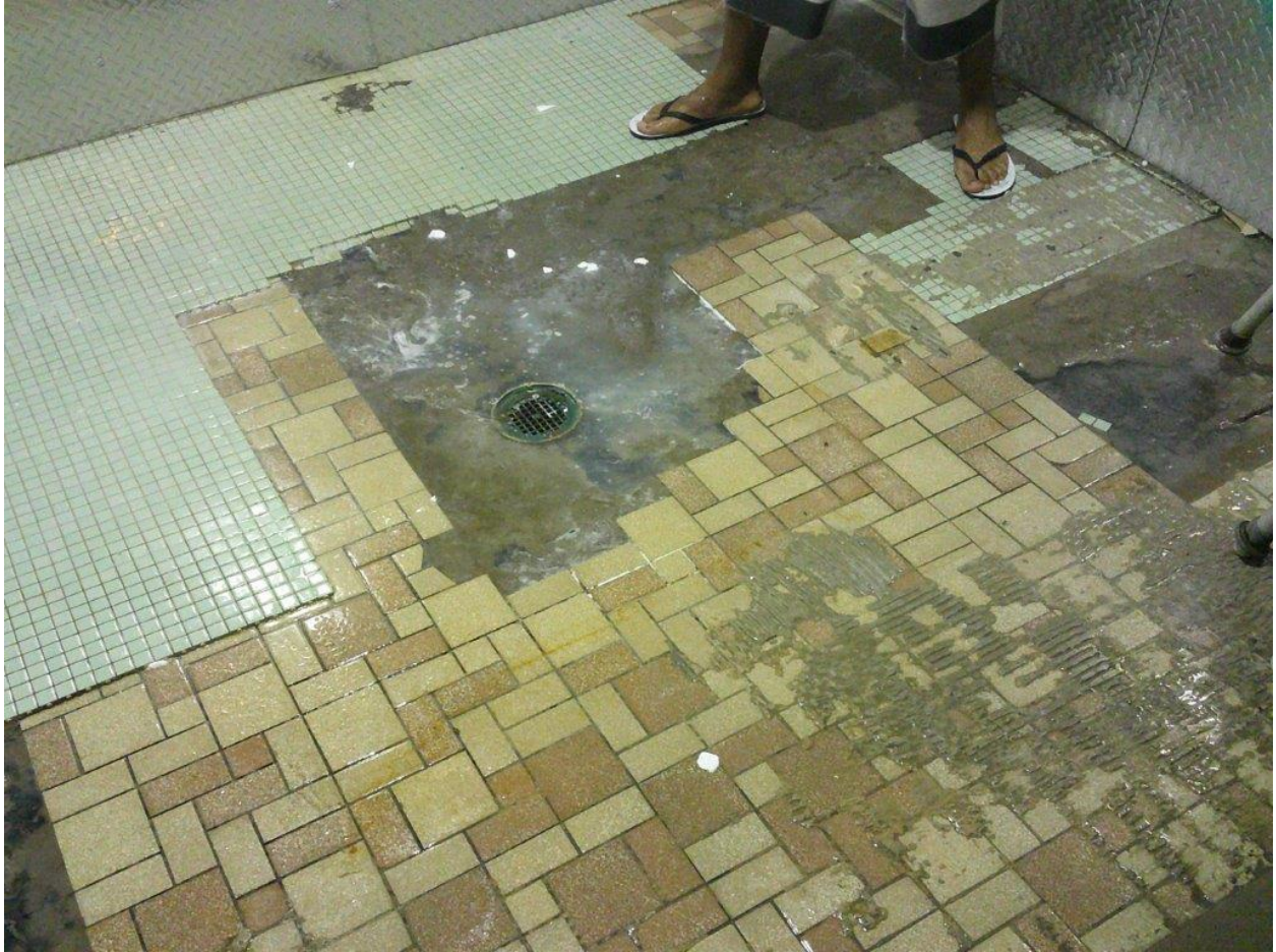
Showers under construction