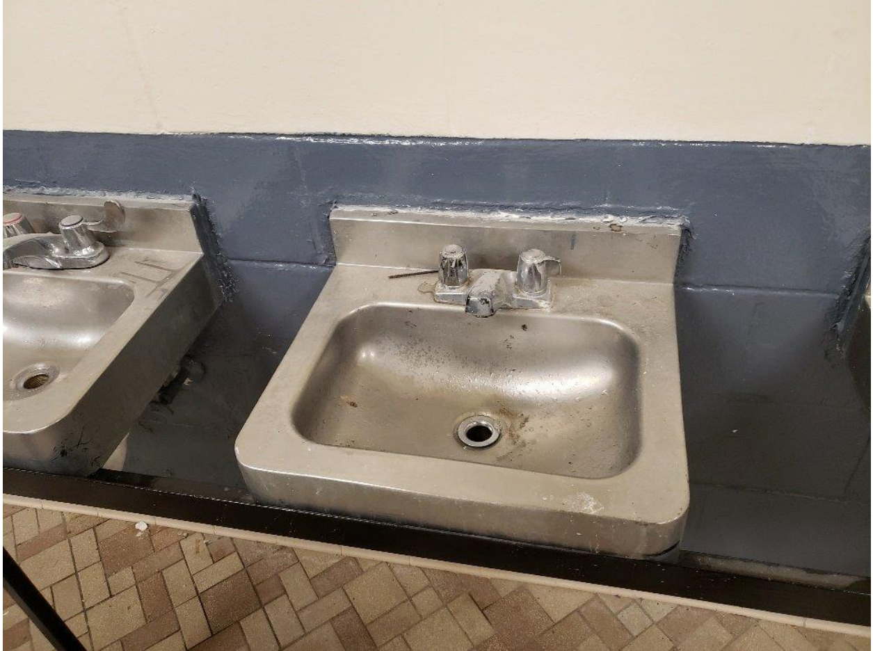
Lavatory sinks not working