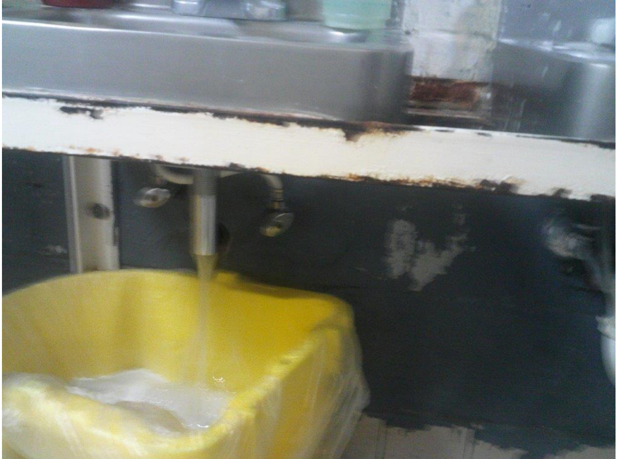
Pipes missing from lavatory sink