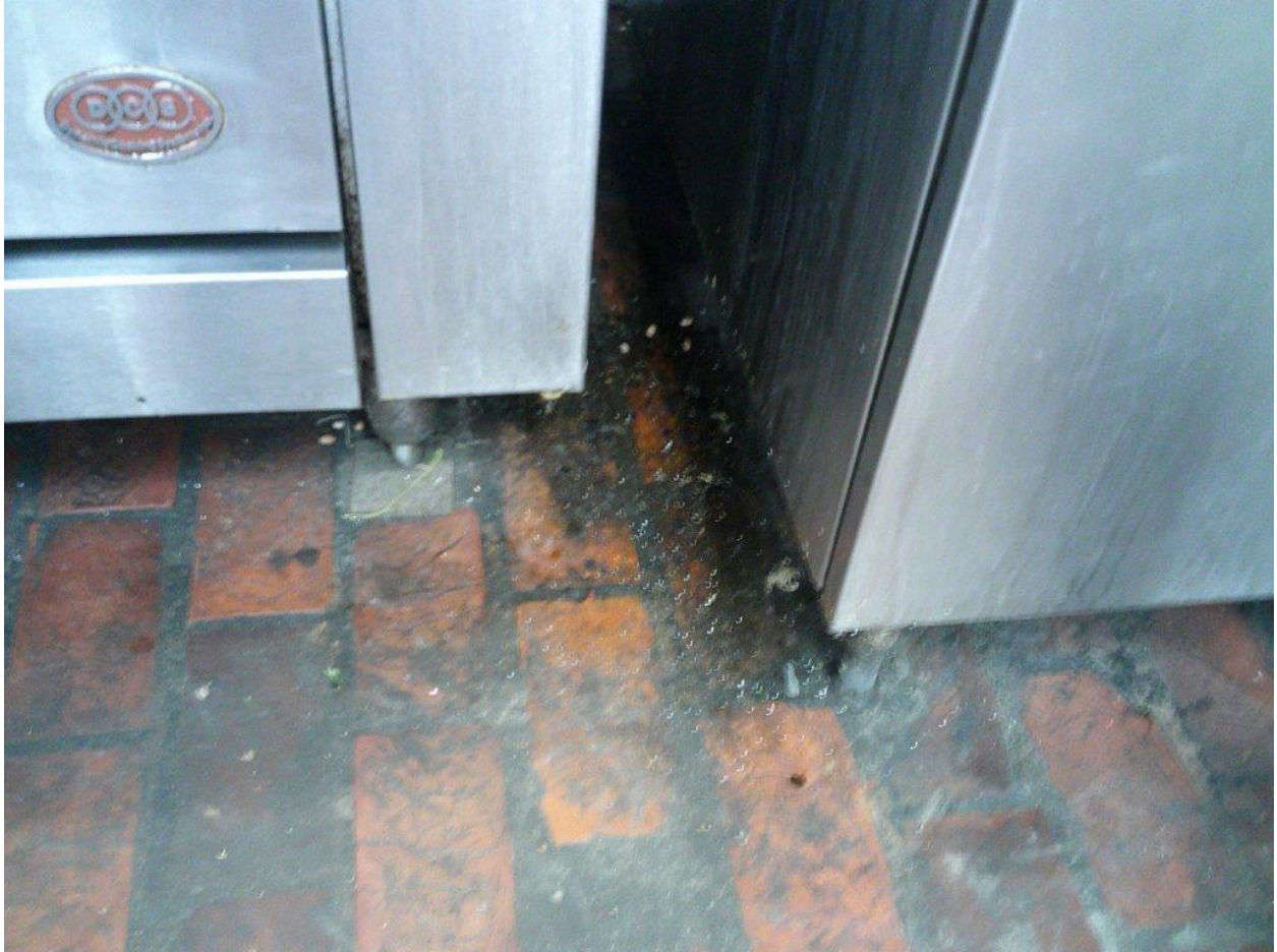
Grease buildup between kitchen deep fryer and oven