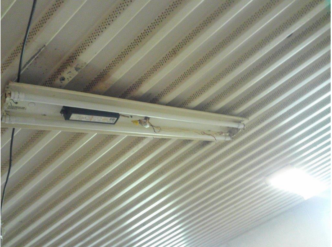
Light fixture not working and has exposed wires