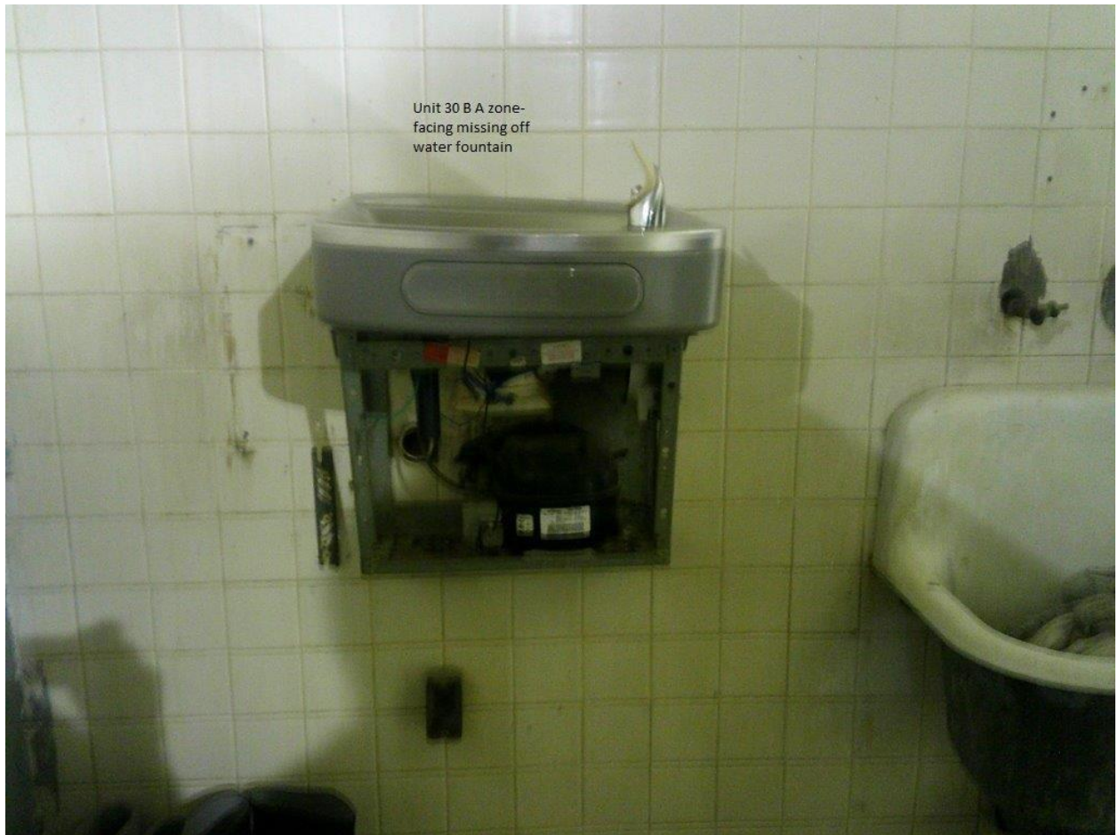
Water fountain is missing front cover