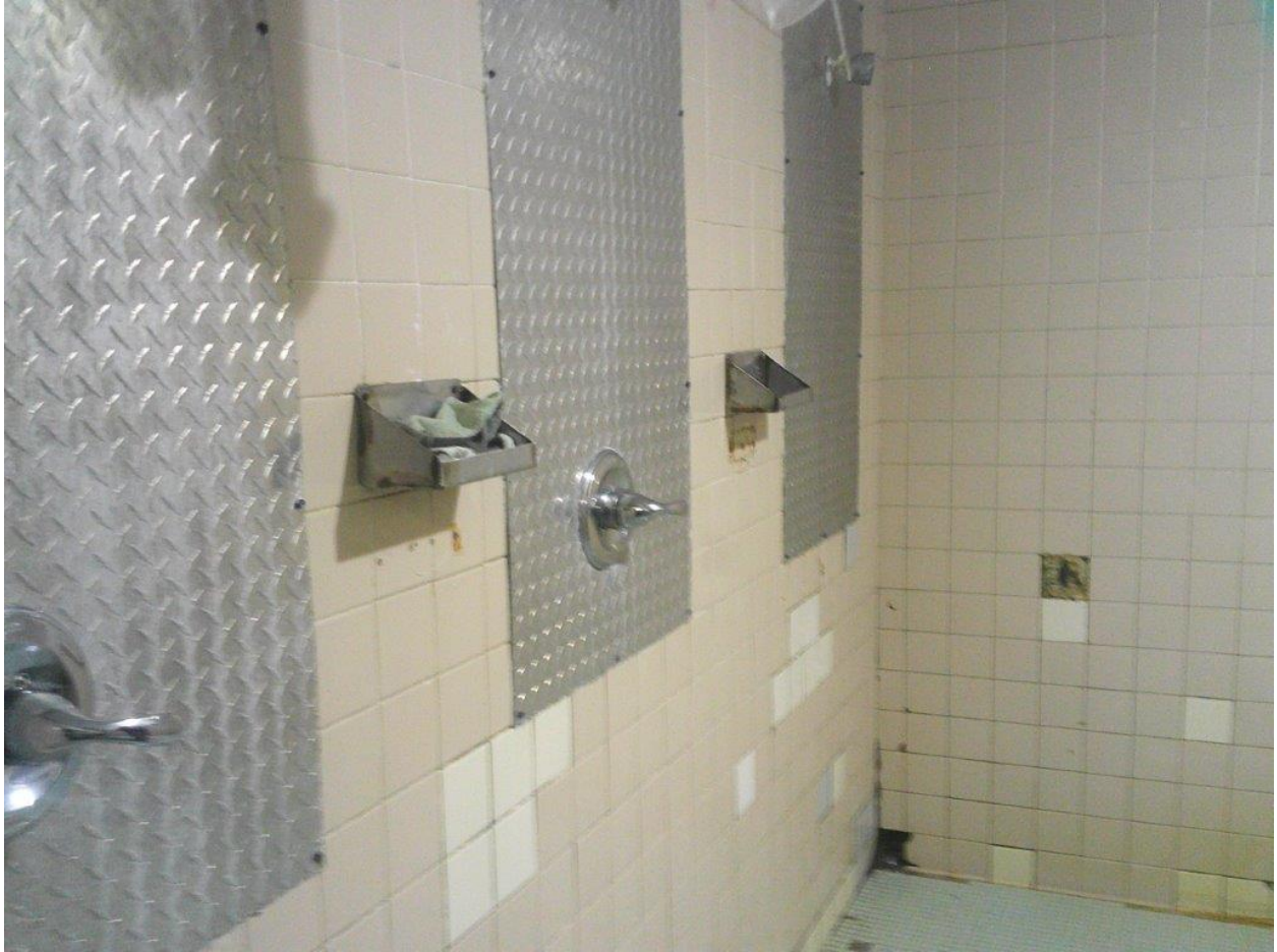
Showers under construction