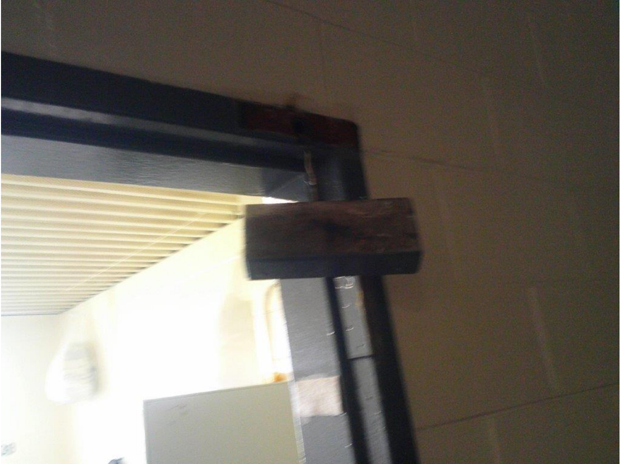
Door mount hanging from door frame