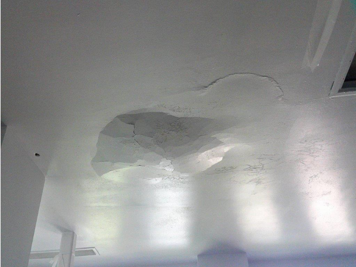
Water leak in the ceiling