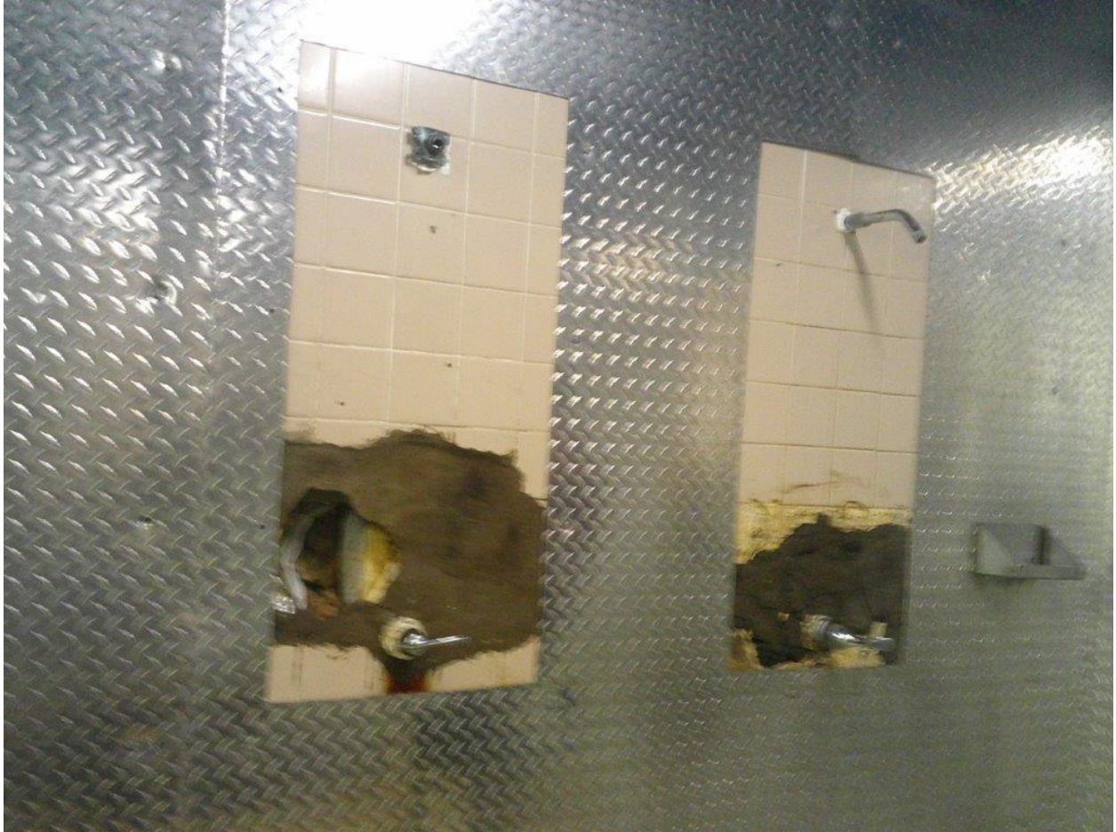
Showers under construction