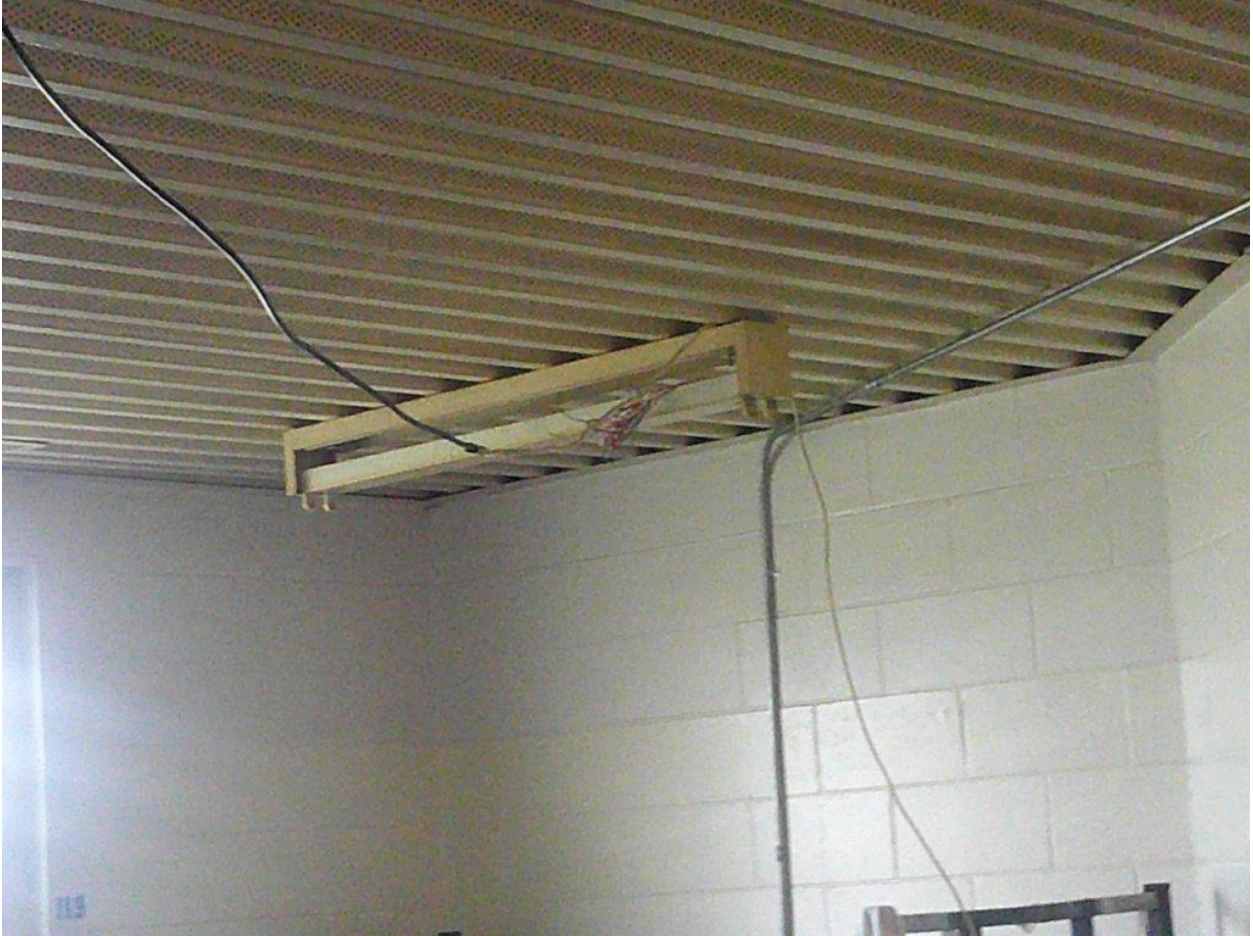
Light fixture not working and has exposed wires