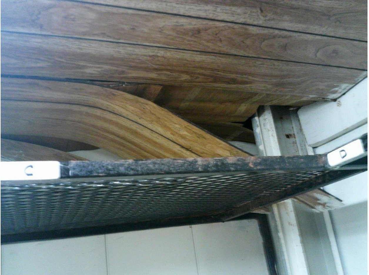
Ceiling in kitchen dry storage falling down