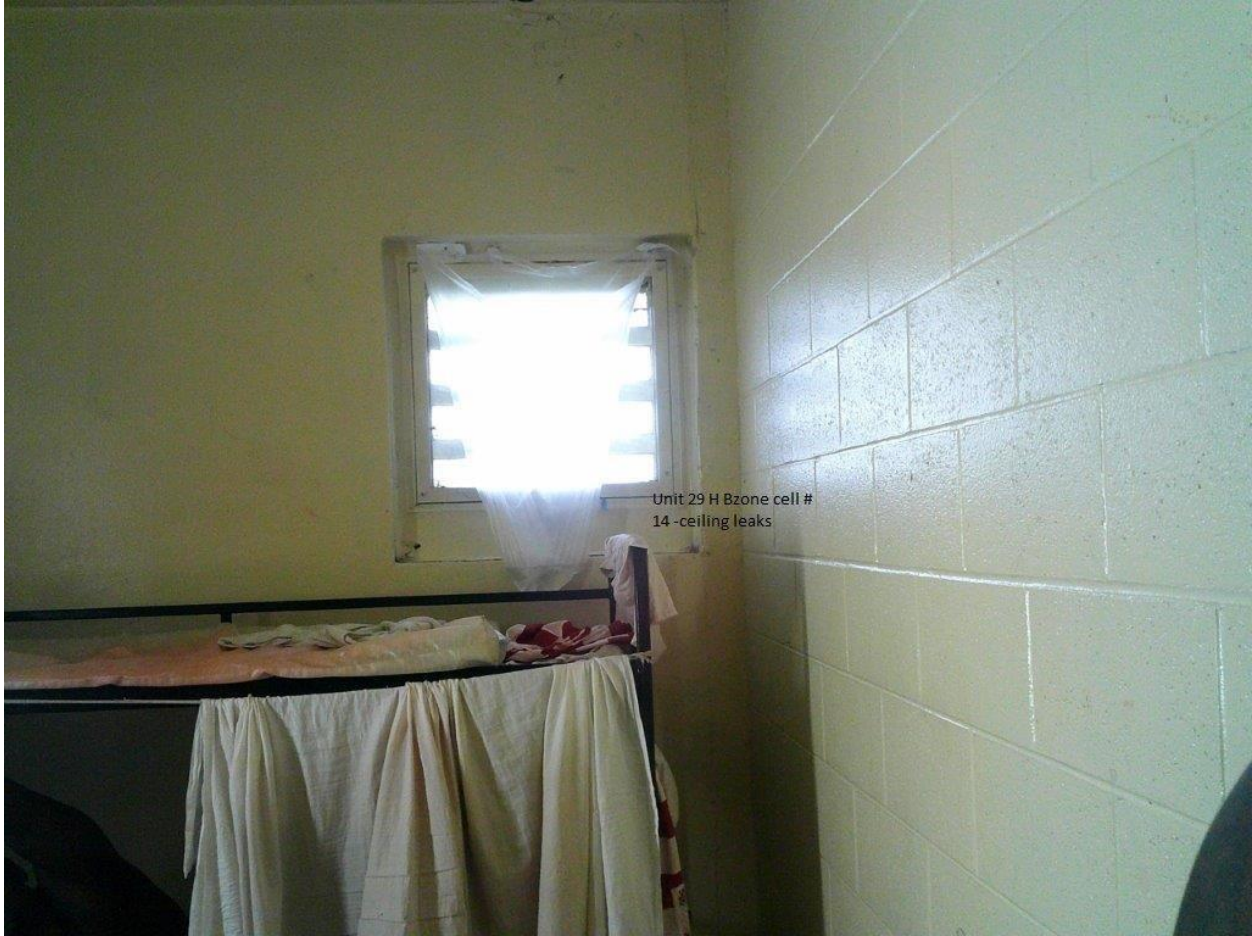
Water leaks around the window seal