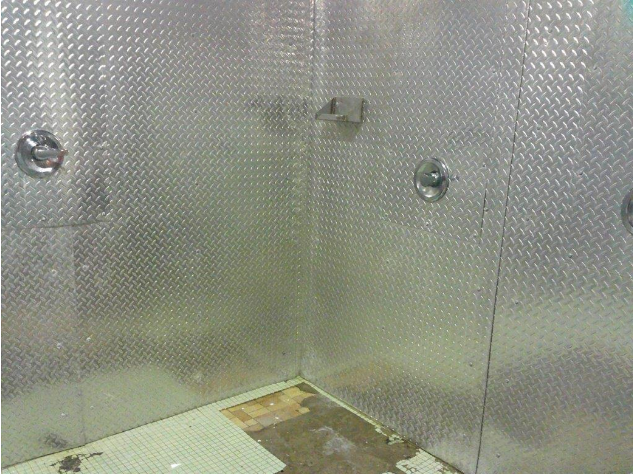
Showers under construction