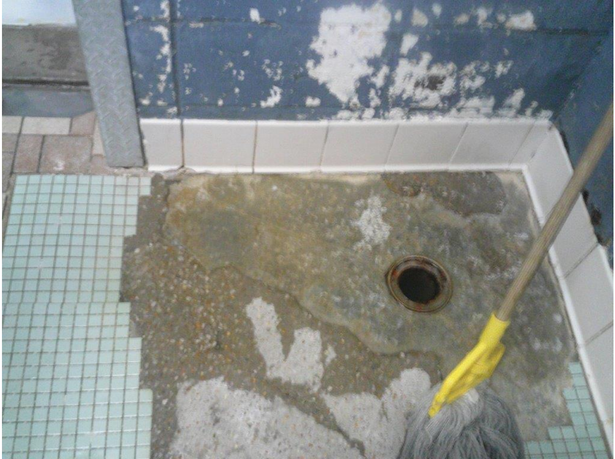
Floor drain has water backing up