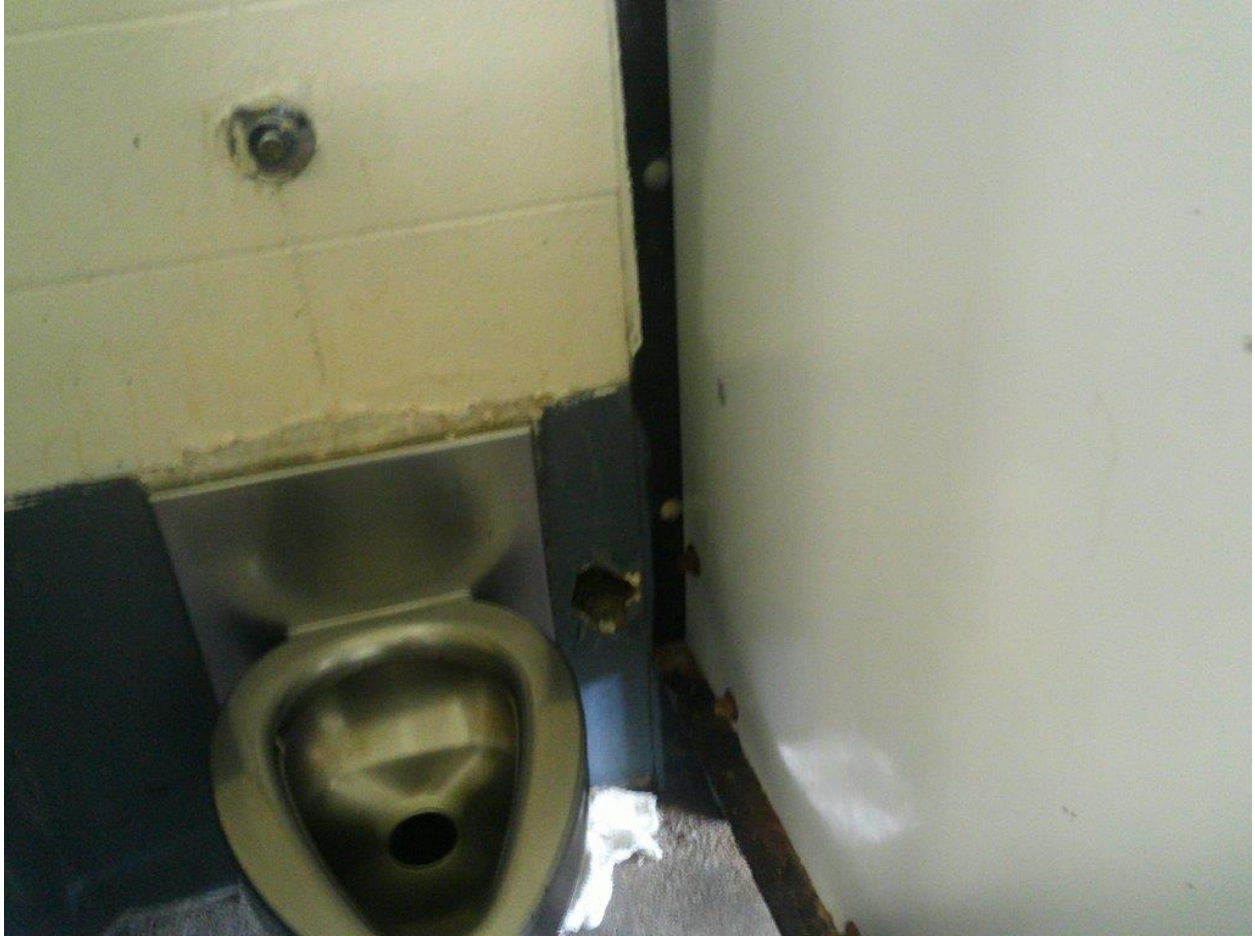
Commode leaking water