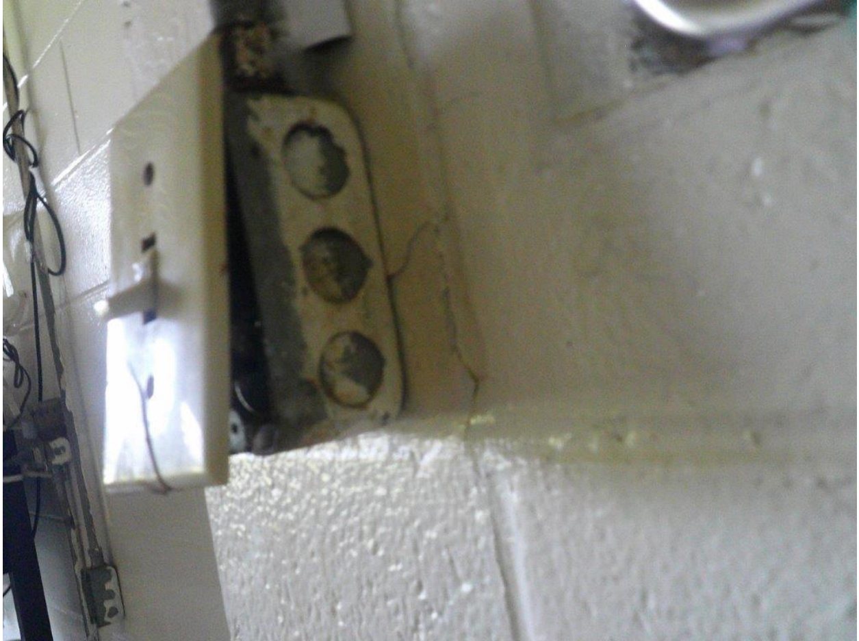
Light switch loose from panel