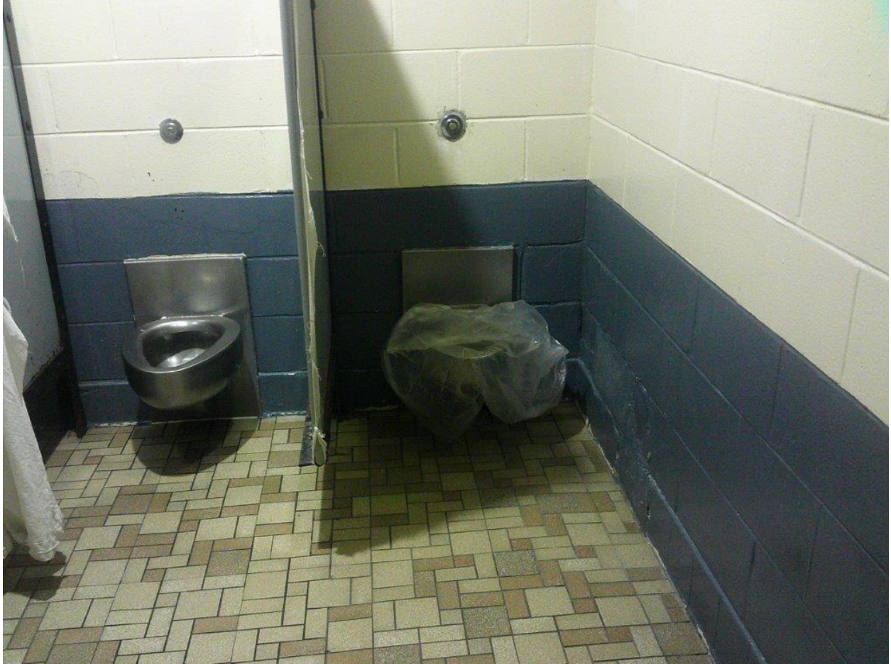
Commode stopped up