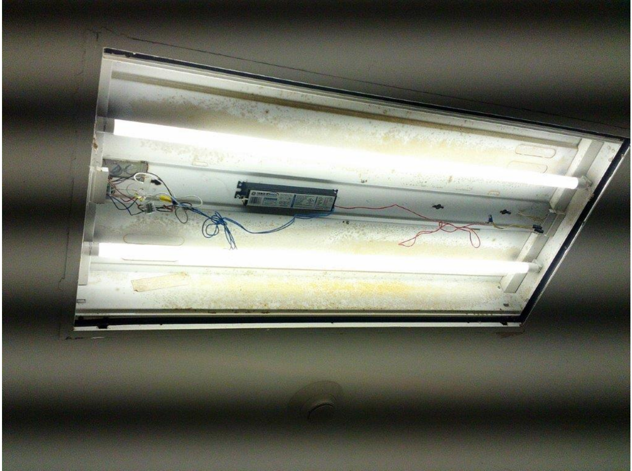
Light fixture with exposed wires