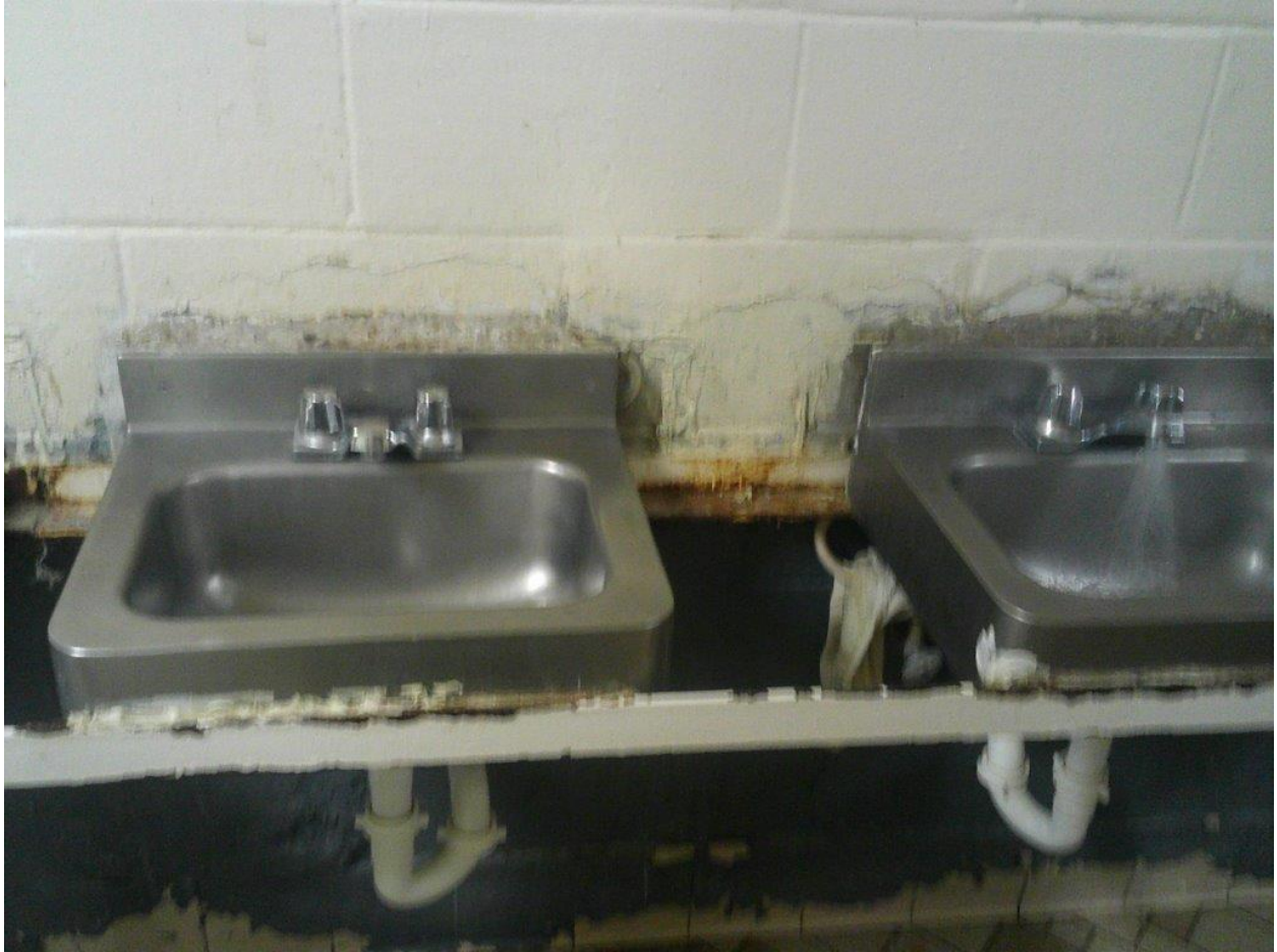
Lavatory sinks leaking water