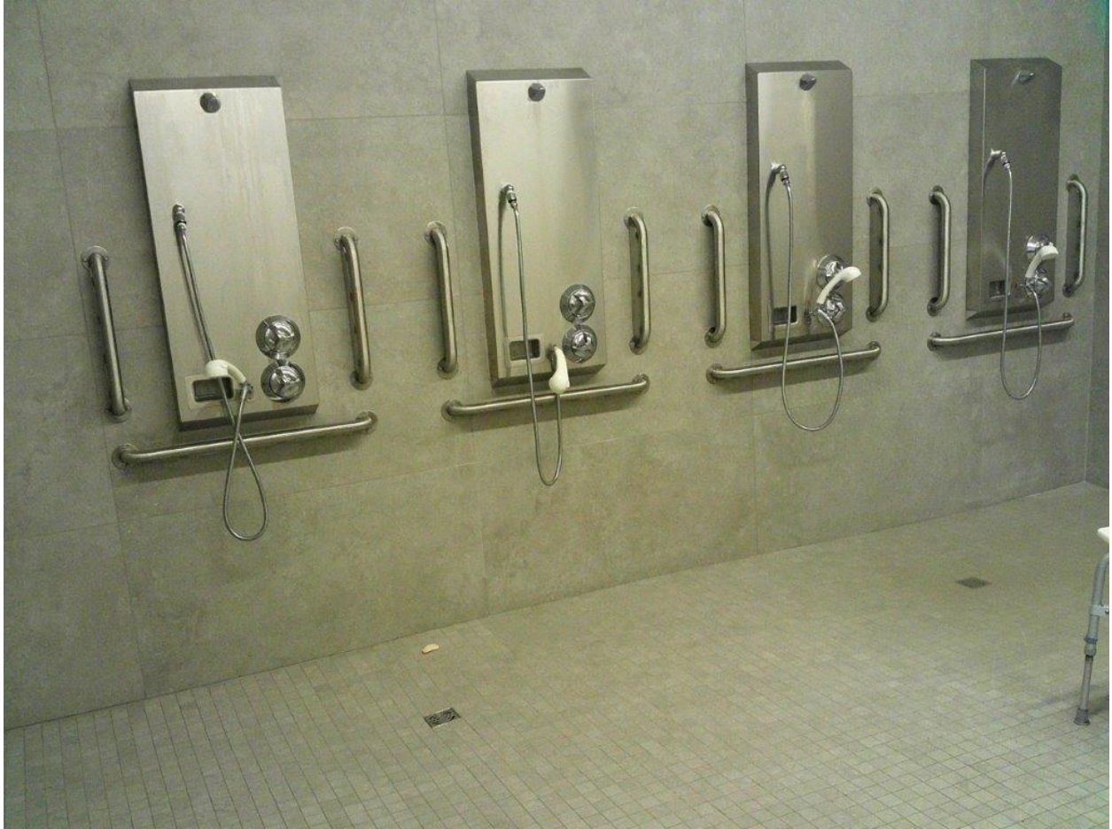
Showers remodeled since last inspection