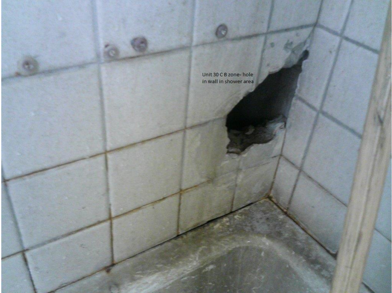
Hole inside the bathroom wall