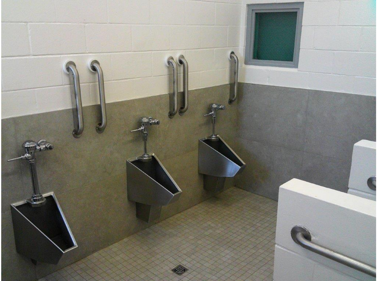
Urinals remodeled since last inspection