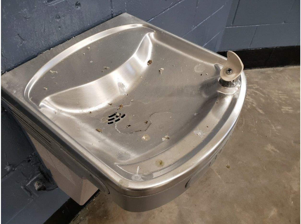
Water fountain stopping up