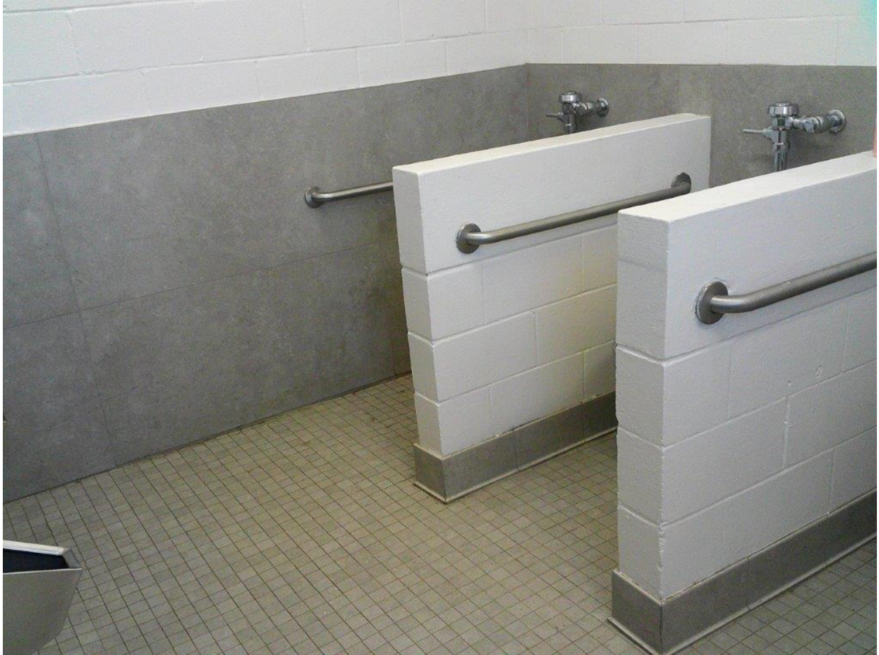
Bathroom commodes and stalls remodeled since last inspection