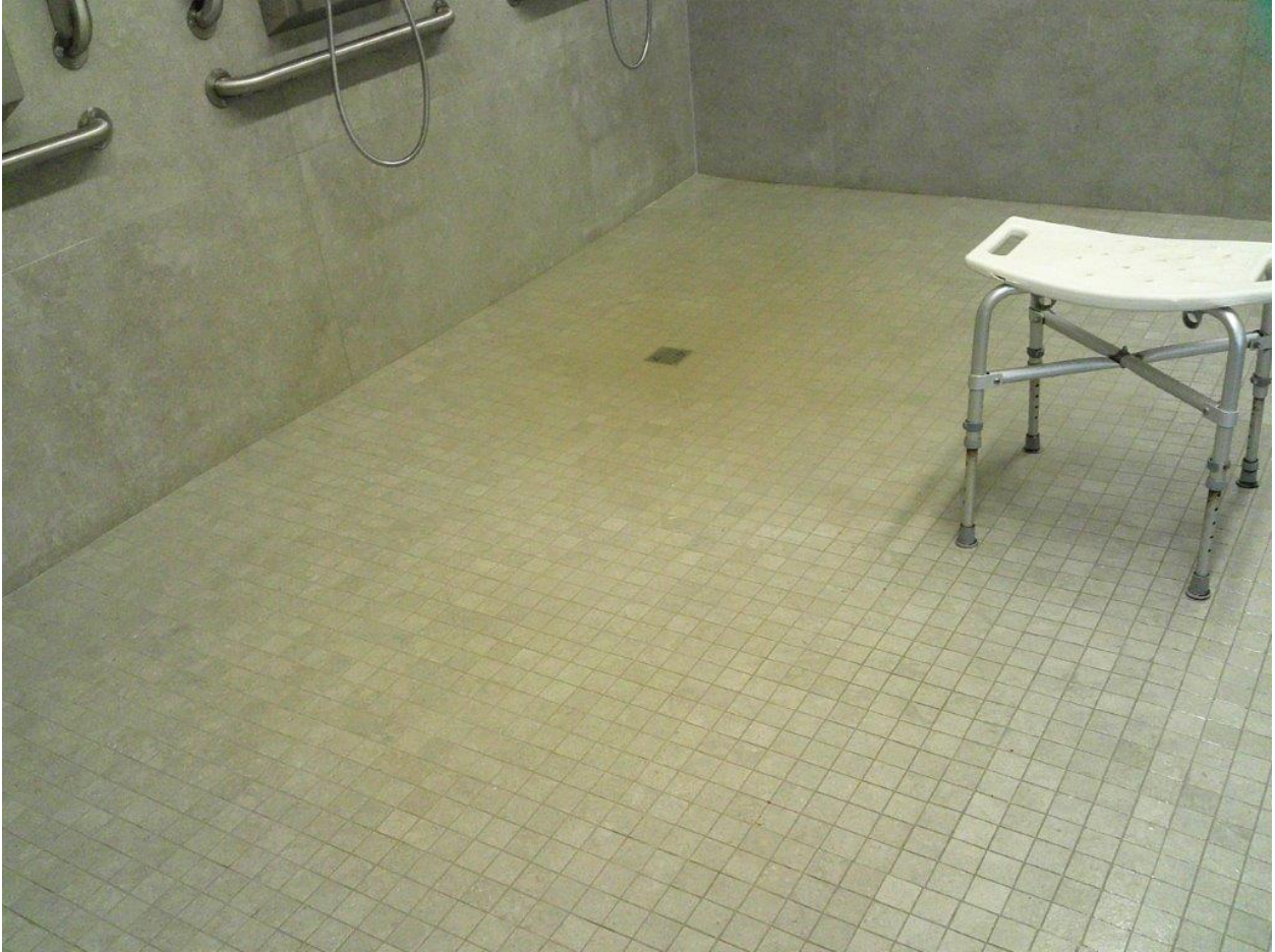
Shower floor remodeled since last inspection