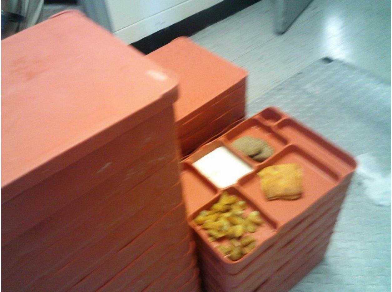
Breakfast Food served below recommended food safety temperature and observed a tray uncovered