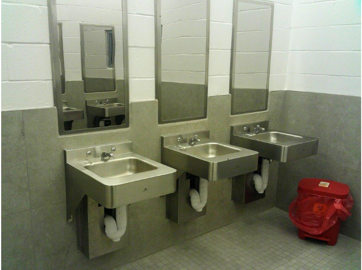
Lavatory sinks remodeled since last inspection