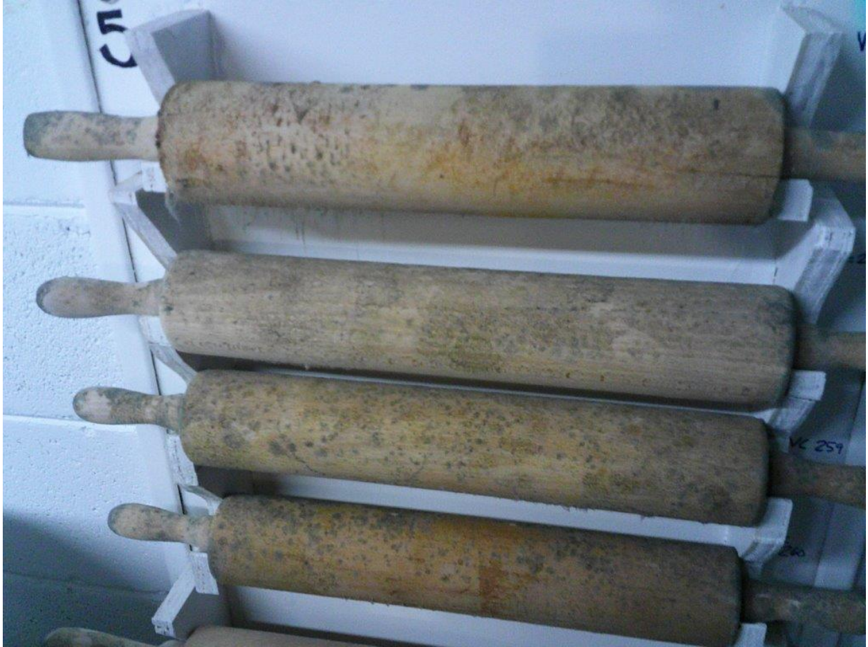
Bread roller pins in storage with mold growth