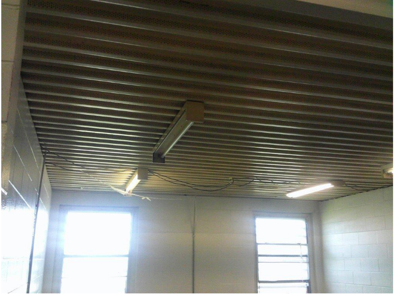
Light fixture not working and has exposed wires