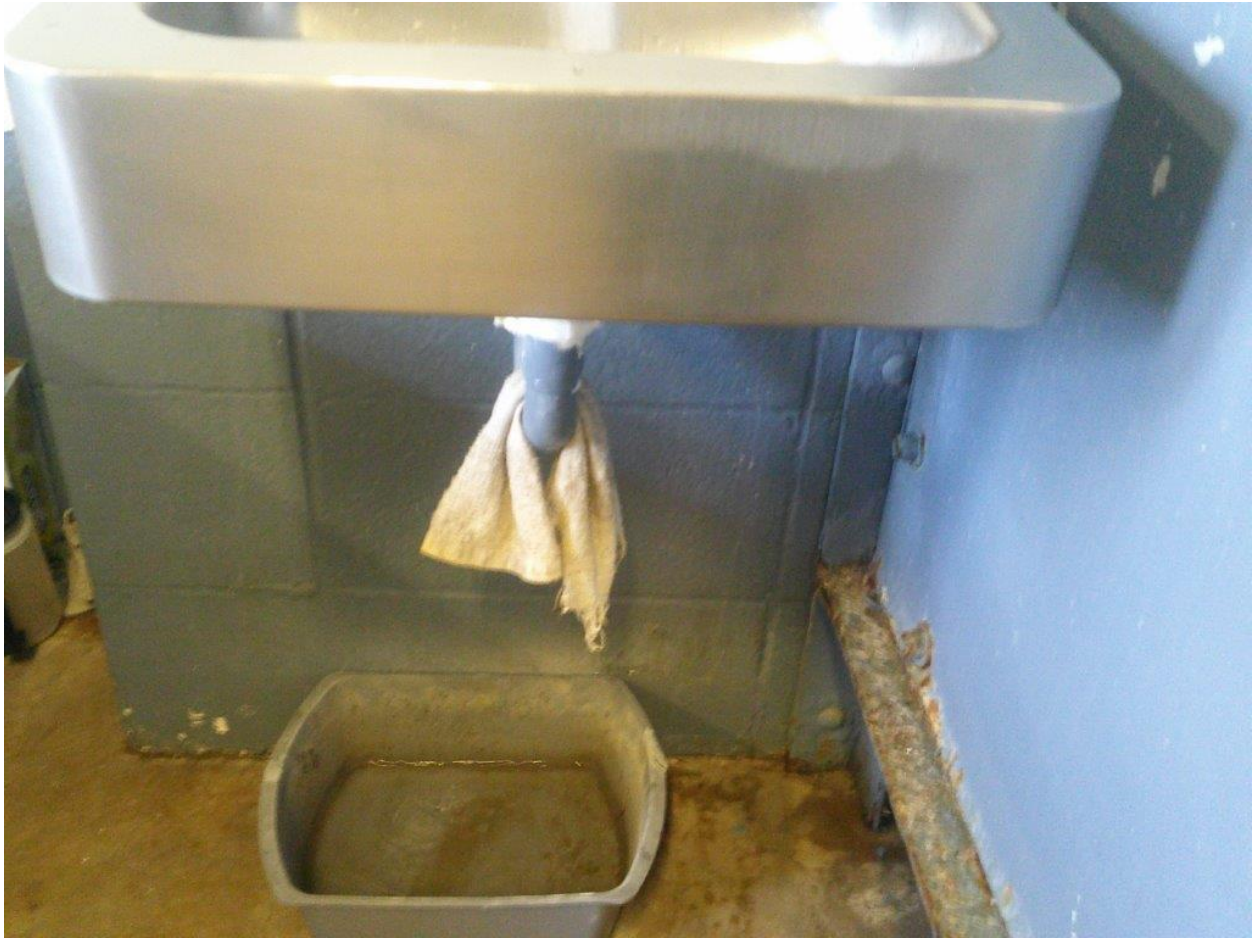
Lavatory sink leaking water