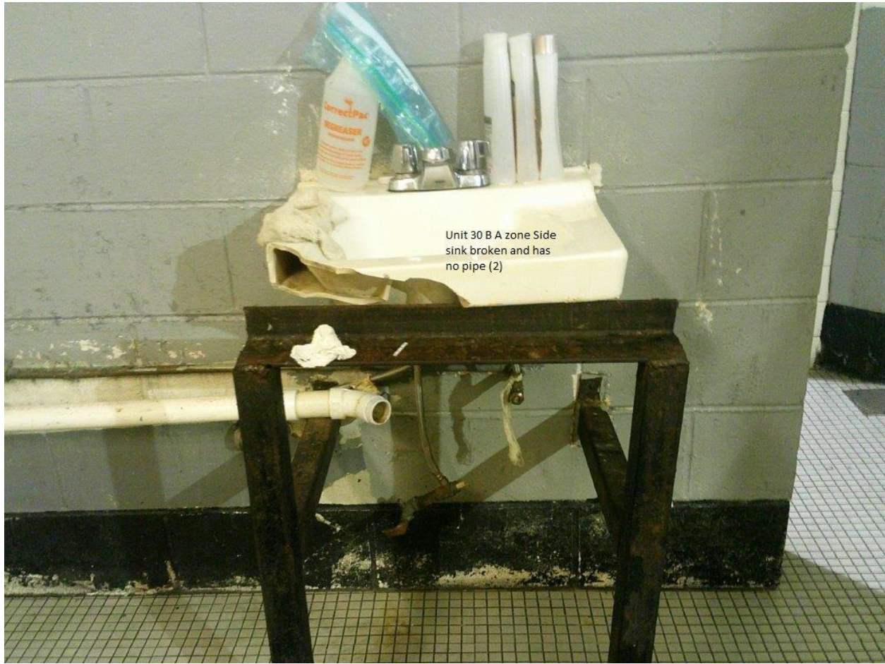
Lavatory sink busted and missing the drain pipes