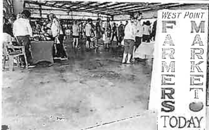
On Thursday June 1, the Farmers Market will return for its 2023 edition for many vendors to sell their homegrown produce and goods.

dailytimesleader.com | @dtleader | facebook.com/dtlbusiness | 75¢