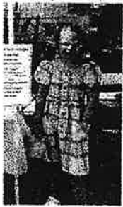
Member of the HGCC.

habitat for wildlife, and reducing energy costs. Four Seasons Garden Club loaned plants to provide a model of canopy planting. Children who visited the garden club booth were given an erosion game to take home; adults received information and a plant. Other aspects of the exhibit were an exhibit of sculpture made from recycled materials as well as posters showing the importance of bats to earth's ecology, especially as pollinators of 300 species of fruit and devourers of insects. Hernando Civic Garden Club, as a member of The Garden Clubs of Mississippi, Inc. and Deep South Garden Clubs, Inc. was glad to support community efforts to celebrate care of the Earth.