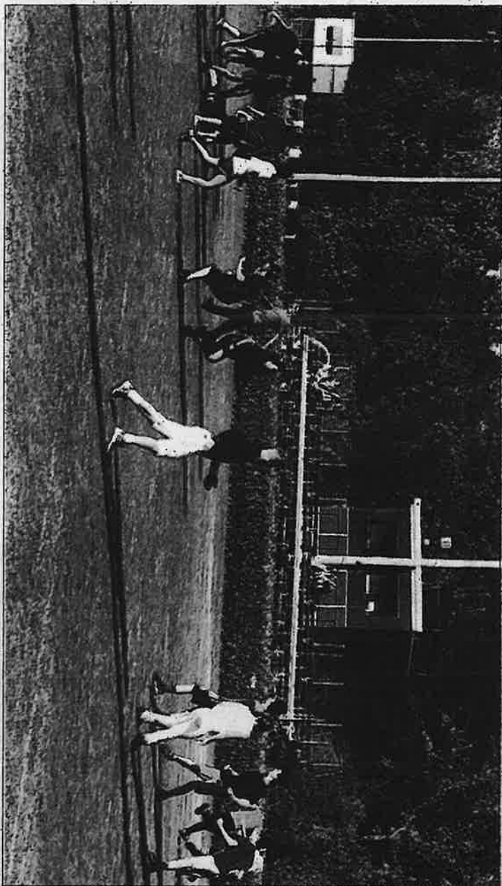
Walnut Attendance Center held a field day on Friday, April 26, 2019's schedule activities included baseball, football, kick ball, basketball, and several bounce houses.