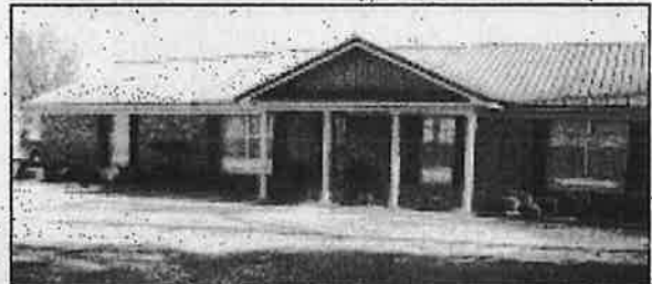
27 Ellis Road, Lambert, MS - Enjoy country living - Beautiful brick house. 4BR, 2 1/2 Bath, Double carport, Central H/A Fireplace, 2450 sf heated area on 1 acre $119,000.

Need houses to sell Have people pre-approved for loans