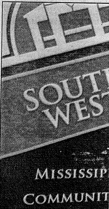
AWARD RECIPIENT- Southwest Mississippi Community College recently held

DATE: 6-7-17 DATE: _____ DATE: _____ DATE: _____ DATE: _____