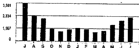
Your Electric Usage Over The Last 13 Months