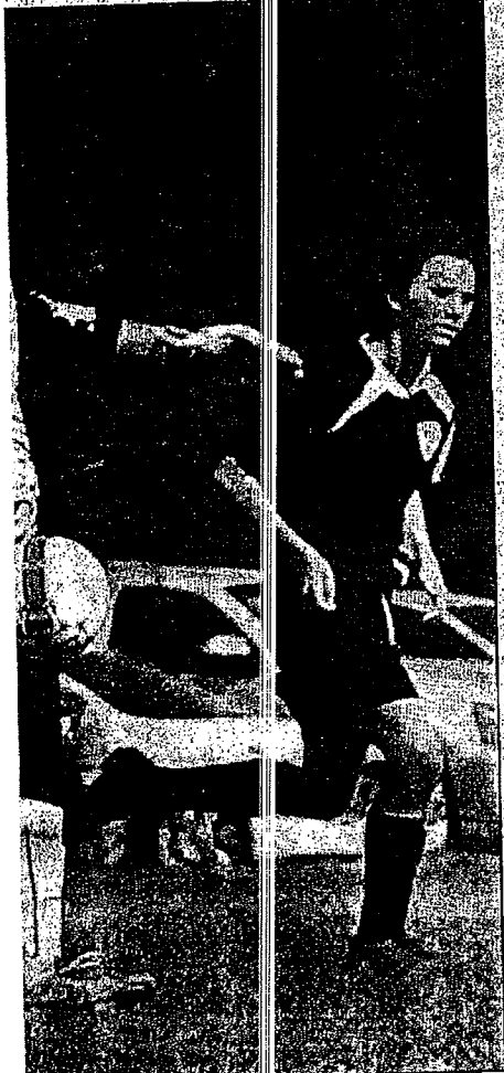
Association Bullies 16-Under team, punts fly go into the opposing teams defending